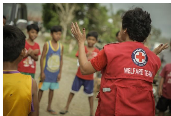
A Philippine Red Cross volunteer conducts play therapy with children affected by Mankghut.

Furthermore, rescuers – community volunteers, police, and firefighters – from Itogon, Benguet where more than 100 miners were killed by a landslide were also provided with psychosocial support. A total of 311 rescuers (208 male and 103 females) were supported by PRC to manage stress caused during the search and rescue, and later during the retrieval of the bodies of the casualties.