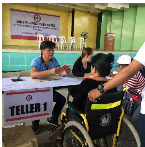
A beneficiary with a disability receives her multi-purpose cash grant from PRC. In its selection, PRC targets the most vulnerable of the affected population.

The British Red Cross, aside from supporting the appeal with contributions earmarked for the multi-purpose cash grants, are also supporting the real-time evaluation of the cash transfer programme currently being conducted. The results of the evaluation will inform the design of cash transfer interventions for Mangkhut operation, both during the relief and early recovery phases.