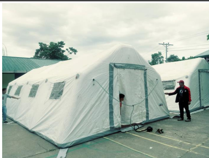
One of the temporary learning spaces provided by PRC to Loacan Elementary School.

PRC has provided child protection orientation to 109 people (PRC staff, volunteers and community members) in Mangkhut affected areas.