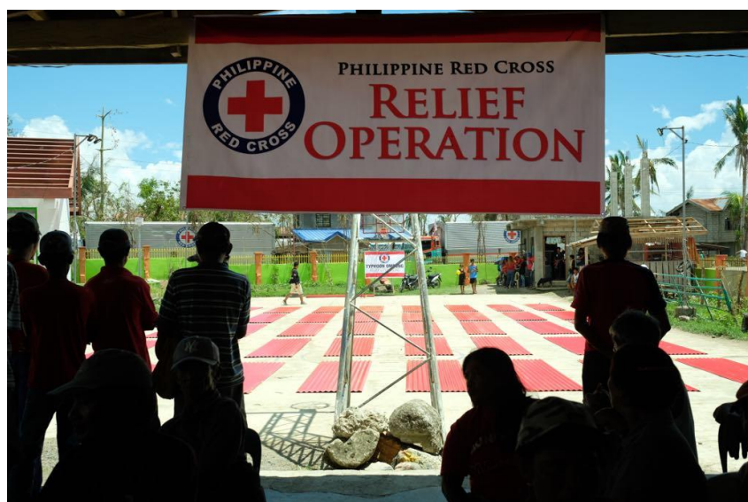
PRC provided non-food items and emergency shelter materials (tarpaulins or corrugated iron sheets) to the typhoon affected families. More than 2,200 houses were destroyed in Baggao municipality, Cagayan, where Mangkhut made landfall.

In addition to dispatching and distributing non-food items to 1,665 households in Cagayan and Benguet, the appeal also covered cost of transporting ICRC shelter toolkits, and Qatar Red Crescent and Australian Government – DFAT NFI stocks, as well as other operational and monitoring costs.