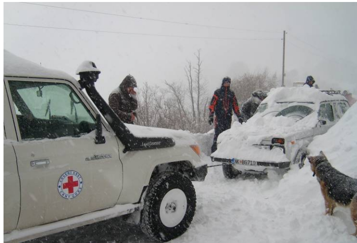
Local RC branch Kolasin in rescue action.

<click here for the DREF budget; here for contact details; here to view the map of the affected area>