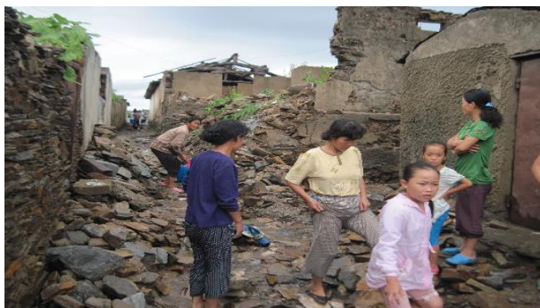
Destroyed Dwellings in Eup Town, Kumchon County, North Hwanghae Province.

To allow for immediate disaster response, DPRK RCS with support from IFRC requested a DREF allocation of CHF 383,123. This operation is focusing on supporting DPRK RCS in disaster response activities, by mobilizing volunteers and staff in conducting needs assessment and provision of non-food items (NFIs), health and water and sanitation interventions and providing first aid and psychosocial support. The operation will last for five months, longer than the standard DREF operation. This is to allow time for potentially lengthy procurement processes for DPRK.