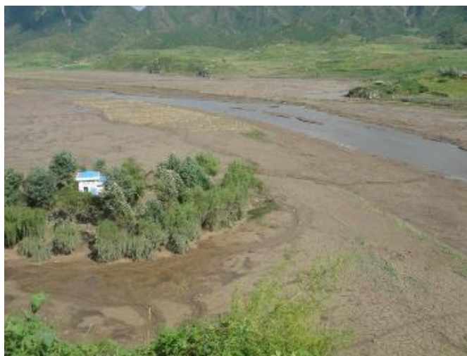
Destroyed Farmland areas.