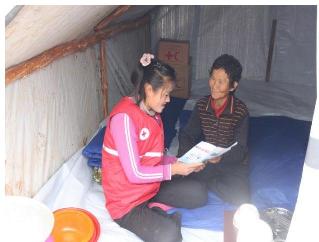
RC volunteer explains the use of hygiene kit, (Photo: DPRK RCS)

Hygiene promotion training for 30 RC volunteers were held in Kaesong City between 11-12 October 2018 to raise the awareness of the participants in the importance of personal and community hygiene in times of disaster. In addition to that, 100 sets of flipcharts and manuals on hygiene promotion for RC volunteers and schoolchildren were distributed to affected communities.