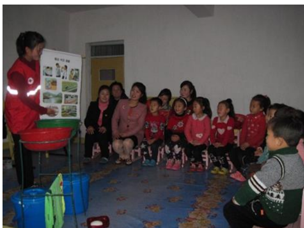
1HP messages delivered by RC volunteer, Kumchon County, North Hwanghae Province, (Photo: DPRK RCS)

As a result, the population now have access to safe and clean water through rehabilitated pipelines. Additionally, procurement of WPT is ongoing but international procurements to DPRK take time.