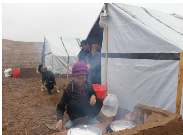
1 Jerry cans used at temporary shelters, Wolam ri, Kumchon County, (Photo: DPRK RCS)

The DPRK RCS conducted detailed assessment between 7 and 9 September to find out the needs. The main water supply pipelines (7,000 meters) were cut out and the government provided water trucking and rehabilitated the pipelines at the same time. At the initial phase of the disaster, there was a certain level of diarrheal cases, however, the MoPH provided prompt anti-typhoid and paratyphoid vaccinations to all groups of people. The community was requesting jerry cans, buckets and hygiene kits. Chlorine was needed to flush away the remnants in the pipes.