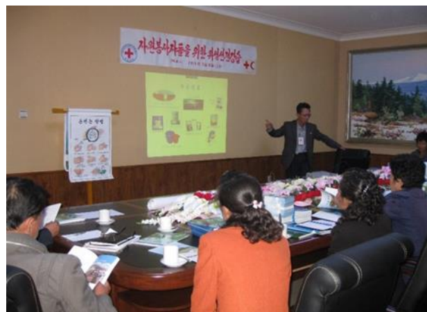
3HP training for RC volunteers, Kaesong City, (Photo: DPRK RCS)