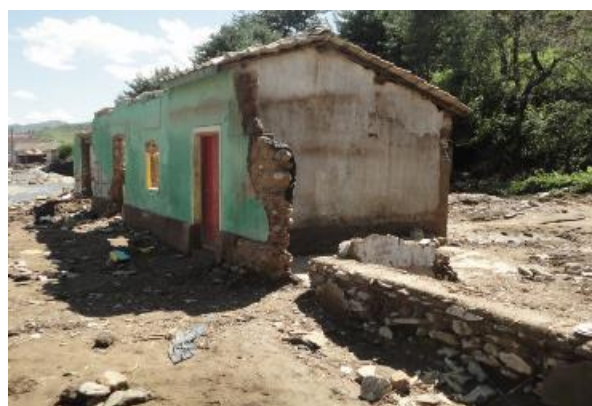
Significant damage to Houses in Eup Town, Jangpung County

DPRK RCS volunteers trained in first aid were the first to respond to the floods along with provincial, county and municipal authorities in both North and South Hwanghae Provinces. The Vice Chairperson of County People's Committee in Kumchon County, North Hwanghae Province praised the DPRK RCS for their immediate action in search and rescue, first aid and transporting injured to the county hospital. Since onset of the disaster, RC volunteers have continued to support the Ministry of Public Health (MoPH) and other authorities in providing assistance to the affected population by offering first aid and treatment for injuries including broken limbs, cuts and other traumas. Specially trained volunteers are offering psychological support. This is particularly important bearing in mind the number of casualties and the number of people including children who are missing, presumed drowned but washed away in the floods. Health promotion activities are being carried out with household doctors from the MoPH emphasizing the prevention and early treatment of communicable diseases. This training is being carried out by DPRK RCS volunteers and community volunteers trained in the Community Based Health and First Aid (CBHFA) methodology.