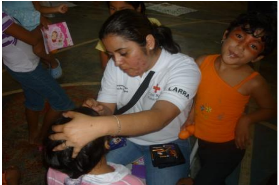
Volunteers of the Red Cross Society of Panama (RCSP) carried out recreational activities with children sheltered in collective centres after the major flooding in December 2010.

Summary: From early November to mid December 2010, Panama experienced a series of unusually strong rains and floods that affected 8 of the 9 provinces in the country as well as 2 autochthonous indigenous territories. In response to the emergency situation, the RCSP mobilized some 200 volunteers, 32 administrative staff and 22 National Intervention Team members to implement activities of their Plan of Action. In support of the National Society's efforts, the current Emergency Appeal assisted 1,545 families with relief items such as blankets, hygiene kits, kitchen sets, food parcels, mosquito nets, jerry cans and cleaning kits. In addition, a water treatment plant was mobilized and safe drinking water was distributed to more than 400 families in Colón, Darién and Panamá provinces. To complement the distribution of safe water, educational talks on prevention of diarrheic diseases were carried out with some 1,922 persons, which were also accompanied by radio spots carrying the same message. The RCSP also reached some 394 families (1,970 persons) through the distribution of 49 family tents and the management of 2 collective centres in Darién province and Embera-