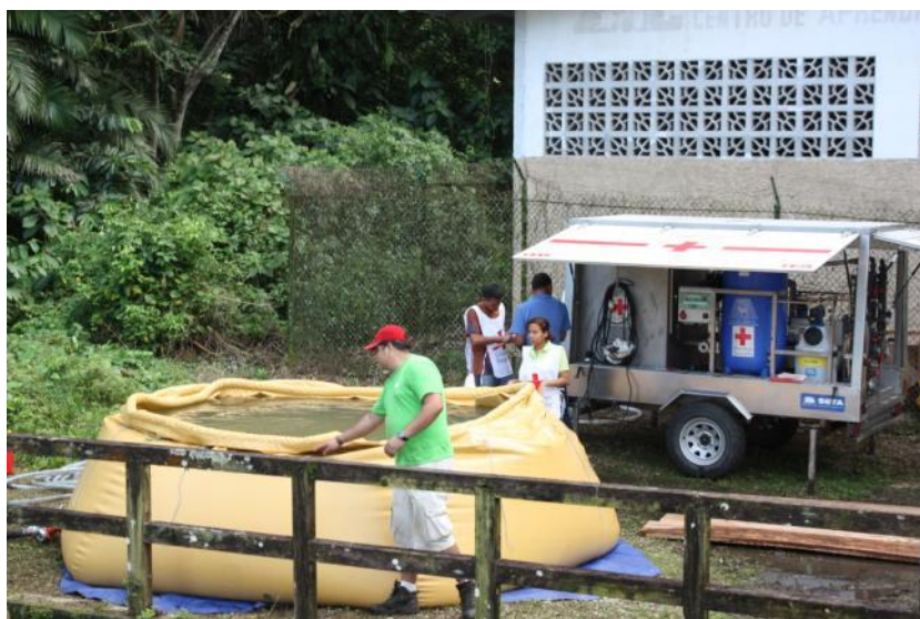
Volunteers from the Red Cross Society of Panama (RCSP) install the mobile water treatment plant in Portobello.

Impact: The approach followed by the National Society to reduce the risk of waterborne diseases had different layers of intervention that combined the distribution of safe drinking water, jerry cans for storage, water treatment sachets (PUR), cleaning kits and bars of soap, jointly with hygiene promotion activities.