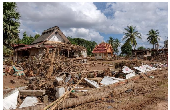
A house damaged by flash flood.

Following Son Tinh was the Tropical Storm Bebinca which hit the country only weeks after. According to UN Information Bulletin No. 5 , all provinces in Lao PDR have been affected, including 2,382 villages, 126,736 households, and 616,145 people. A total of 1,779 Houses are destroyed and 514 damaged. 90,000 ha of paddy fields and 11,000 ha of other plantations have been destroyed, and 630 km of roads and 47 bridges have been damaged, report says. According to the findings from the ongoing