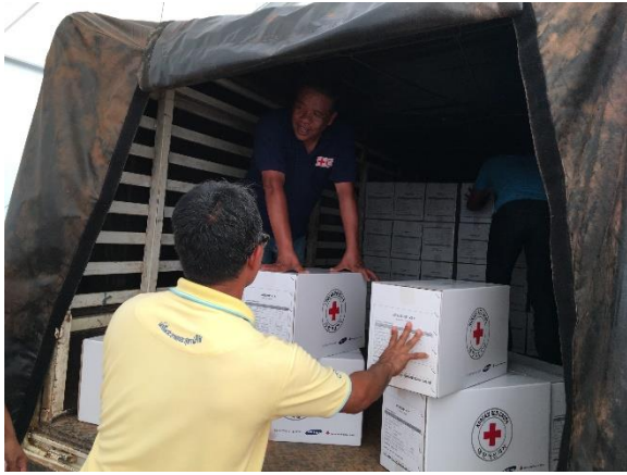
Lao Red Cross prepares items for distribution.

Through bilateral support to LRC, German Red Cross (GRC) has assisted the Shelter component of the Emergency Appeal (EA), under which tarpaulins and shelter tool kits were given to 1,000 families, along with the shelter orientation. Although the EA initially targeted 1,500 households as recipients of tarpaulins and shelter tool kits, GRC and IFRC later agreed to reduce the number of the target recipients of tarpaulins and shelter tool kits under the EA from 1,500 to 500 households. GRC agreed to lead the implementation of these distribution together with providing shelter orientation. Meanwhile, the IFRC provided logistics arrangement such as the erection of GRC warehouse tent and delivered relief goods to distribution points.