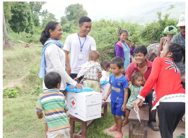
Families from Don Muang Village were provided with hygiene kits

The operation has mobilized a number of RDRT members within the RCRC Movement such as the International Committee of Red Cross (ICRC) Regional Office in Bangkok, the IFRC Country Cluster Support Team (CCST) Bangkok, and IFRC Asia Pacific Regional Office (APRO).