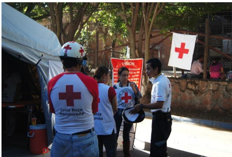
Volunteers of the Honduran Red Cross (HRC) remain near the Attorney General's Office morgue to provide psychosocial support to affected families retrieving the bodies of their relatives.

81,792 Swiss francs have been allocated from the IFRC's Disaster Relief Emergency Fund (DREF) to support the Honduran Red Cross (HRC) to replenish medical stocks and to provide pre-hospital care to penitentiary inmates and psychosocial support to some 400 families. Unearmarked funds to repay DREF are encouraged.