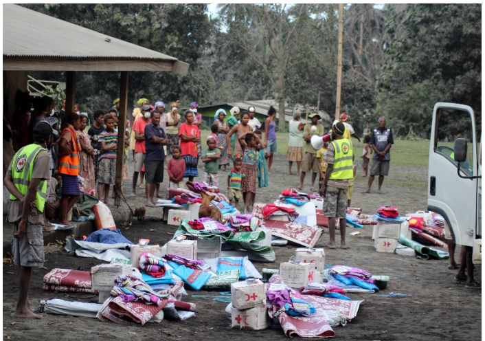
Distribution of relief items in a village on Ambae, (Photo: VRCS)

On 17 July 2018, two distribution teams were deployed (one to the West of the island and one to the East) which included staff and volunteers from headquarters, Sanma and Penama branches. Over 30 local ERT volunteers were mobilised to distribute relief items to a planned 1000 affected households.