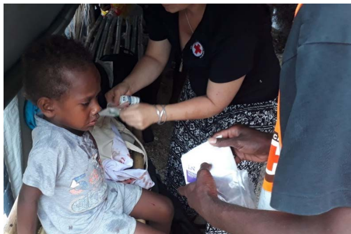
VRCS staff and volunteers providing first aid to a young child in Maewo, (Photo: VRCS)

The majority of reported first aid cases were for household accidents with lacerations, wounds and bumps and bruises and infections recorded in 25 of cases. Over half of these were in small children with 2 hospital transfers referred to Kerebei health clinic. There were 6 cases of diarrhoea and vomiting where they were provided with ORS solution and 1 transferred to the hospital for severe diarrhoea. In Santo only 2 people were recorded as requiring First aid for wounds. Unfortunately, not all first aid response incidents were reported. Data on the reported first aid cases by island is presented below.