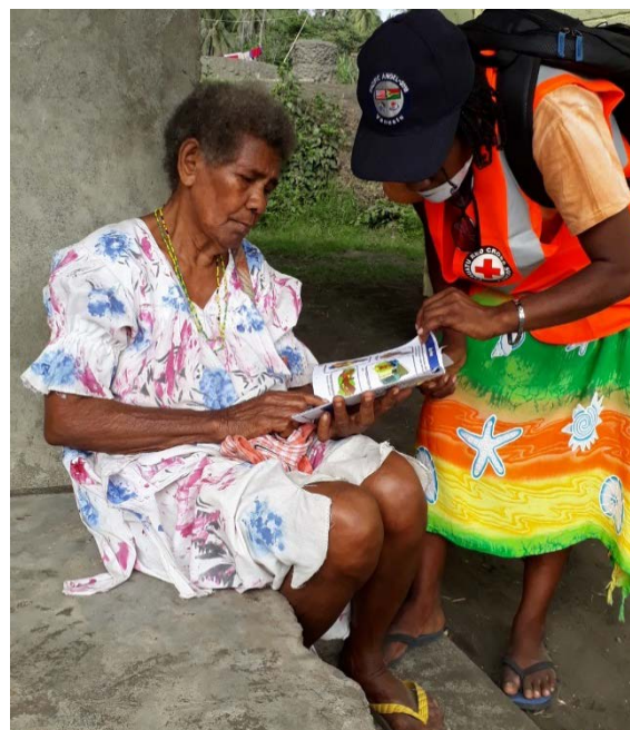
VRCS Volunteer in West Ambae going through the illness prevention and health promotion book that was given out during the distribution activities with an elderly evacuee, (Photo: VRCS)

A household health promotion and illness prevention booklet prepared in Bislama in consultation with Health and WaSH clusters was provided to 1094 households in Ambae. This booklet contained information on handwashing, epidemic control information focusing on Malaria, Dengue, Acute respiratory infection information, acute watery diarrheal prevention and management, safe food preparation, hygiene promotion such as tippy tap construction and household water filtration methods, PSS awareness, menstrual hygiene management (MHM) awareness, violence prevention and first aid DRSABC poster. The booklet was provided alongside health awareness sessions to 1094 households in Ambae at the time of relief distribution. Further awareness activities and awareness sessions were undertaken in Maewo, Santo and Malo following the evacuation of the Ambae population during August and September.