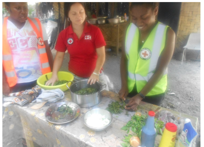
Manioc leaf cooking demonstrations provided a substitute for green leafy vegetables.

PSS volunteers were stationed in Santo at Niscol Wharf, an evacuation centre specifically dedicated to people with disabilities, chronic illness and their carers. Activities undertaken by volunteers stationed at the Niscol Wharf terminal included social games, self-care and personal care support, cooking, cleaning, PSS awareness and individual support sessions.