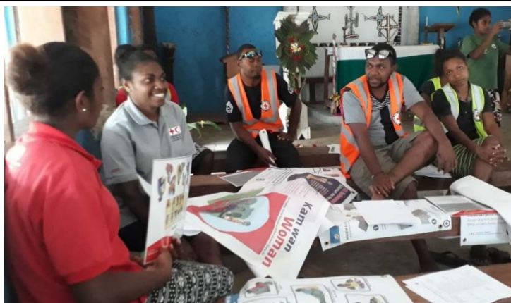
Wash & MHM orientation in Maewo.

All VRCS WaSH activities were coordinated through the WaSH cluster and approved by the Department of Water Resources (DoWR). The DoWR focal point was consulted and also included in various orientations to ensure consistency of messaging. The WaSH cluster supported the WaSH awareness activities in Maewo with the provision of a vehicle for two weeks of the initial awareness.