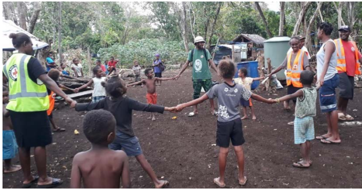
VRCS volunteers in Santo play a mosquito and dengue version of the cat and mouse game during epidemic awareness, (Photo: VRCS)