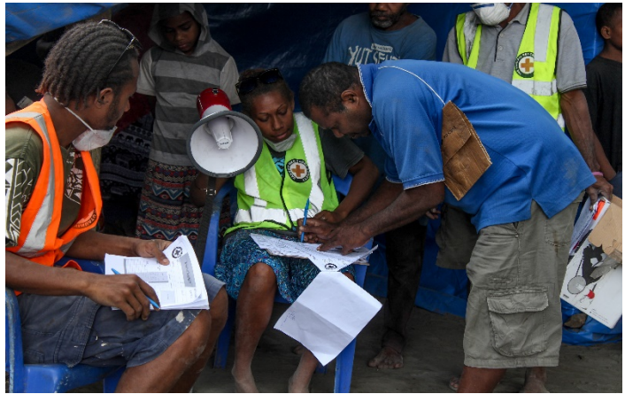
VRCS volunteers register voluntary evacuees on Amba

On 25 May 2018, a shelter delegate from the IFRC was deployed to Ambae along with the VRCS Operations Manager to conduct a training of trainers (ToT) for construction of emergency shelter utilising the distributed shelter tool kits. 15 volunteers in Ambae took part in this training so that they could assist the evacuated communities with the construction of their own shelters. During the first weeks of June, these trained volunteers worked in collaboration with the Penama Provincial Disaster Committee to continuously assess the situation on Ambae with a focus on the shelter needs at evacuation centres. They also assisted in the registration of people who were wishing to evacuate voluntarily to Maewo.