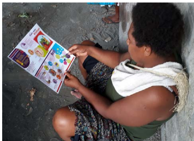
A woman reads the MHM IEC materials provided during the session, (Photo: VRCS)