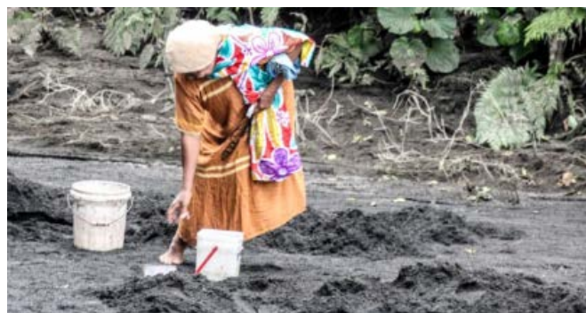
A woman digs under the ash in Ambae to collect water, (Photo: VRCS)

On the 12 April, the Council of Ministers declared a State of Emergency (SOE) for the entire island of Ambae for a period of 3 months. The SOE also came with indication of the plan by the National government to assist with voluntary evacuations up until 30 April. After this, they planned for mandatory evacuations over a 2-week period until 15 May. Following this initial decision, resistance from the provincial government and a reduction in the severity of the effects of the volcano prompted the government to revise their decision to allow for voluntary evacuation rather than mandatory. However, in mid-July the volcano's activity increased again and on the 21 July, the level was again increased to level 3. This prompted the government to order the compulsory evacuation of the entire island. During the first week of August, the people of Ambae were either evacuated to nearby