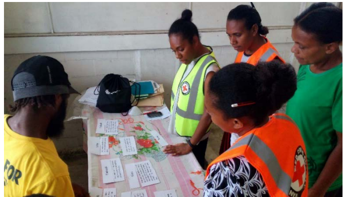
Volunteers in Maewo August 2018 undertaking Health & WasH pre-deployment orientation and briefing.