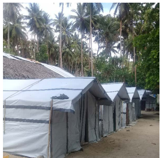
Emergency shelters constructed by VRCS volunteers on Maewo, (Photo: VRCS)

Following the updated State of Emergency declaration issued on 26 July 2018 where a compulsory evacuation was declared, 2,710 people evacuated to Maewo – a total of 836 households. The Vanuatu Red Cross Penama branch office moved with the evacuees to Maewo to continue supporting the affected population. Twenty volunteers from Maewo were recruited to assist the 15 shelter trained volunteers from Ambae to conduct shelter awareness and build or assist in the building of emergency shelters for all 836 households on Maewo. 5 volunteers were also deployed from Santo to assist in the construction of the emergency shelters and to support the Ministry of Education through the setup of three temporary learning spaces (Nasawa Primary school, Gambule junior Secondary School, and Gnota primary school).