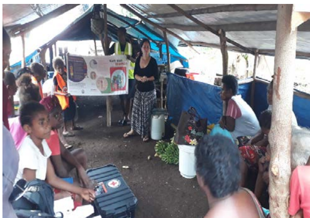
MHM awareness session with women in Santo, (Photo: VRCS)

Initial awareness sessions for WaSH and MHM were provided to 1,094 households in Ambae, West, East, North and South during the month of July alongside the NFI distribution. Further awareness activities and awareness sessions were also undertaken. The additional data for sessions conducted outside of the distribution awareness sessions can be seen below.