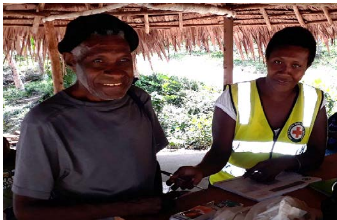
VRCS Maewo Volunteer handing out phone cards in September 2018

Although this part of the response faced some challenges, data from the beneficiary satisfaction survey shows that beneficiaries were overall very positive about the receipt of the credit saying that it allowed them to connect with family and especially children who were sent to schools away from their families.