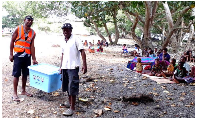
VRCS Volunteer in Maewo September 2018 handing over a PSS comfort kit to a community elder for use by the community, (Photo: VRCS)

As part of the psychosocial support response, VRCS distributed phone credit to affected households to allow them to reconnect with family who may have been separated during the evacuation. 1000 vatu was provided per household with the option to split the credit between two phones. VRCS worked with the two telecommunications providers in the country to devise a strategy for distribution. Phone numbers of affected households were collected at the time of the relief distribution to allow for electronic transfer of the credit to take place. PSS face to face support sessions in Maewo and Santo during the month of August were also utilised to capture the telephone numbers of households who scored higher on the vulnerability analysis such as; those who had a disability, was severely ill, was pregnant or breastfeeding, a widow or female headed household. Following the initial electronic transfer of credit, further distribution was undertaken through the physical handing out of phone cards to affected populations.