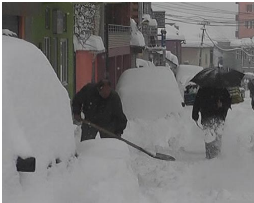
Landscape in the town of Bulqiza.

Summary: Harsh winter with unusually abundant snowfall (1-1.5 m of snow in rural areas with temperatures averaging minus 10° Centigrade) hit the northern and north-eastern parts of Albania. The snow is blocking some national and many rural roads, and the number of snow-trapped people in the communes of Puka, Shkodra, Kukes, Peshkopia, Librazhd and Korça districts is estimated at about 100,000.