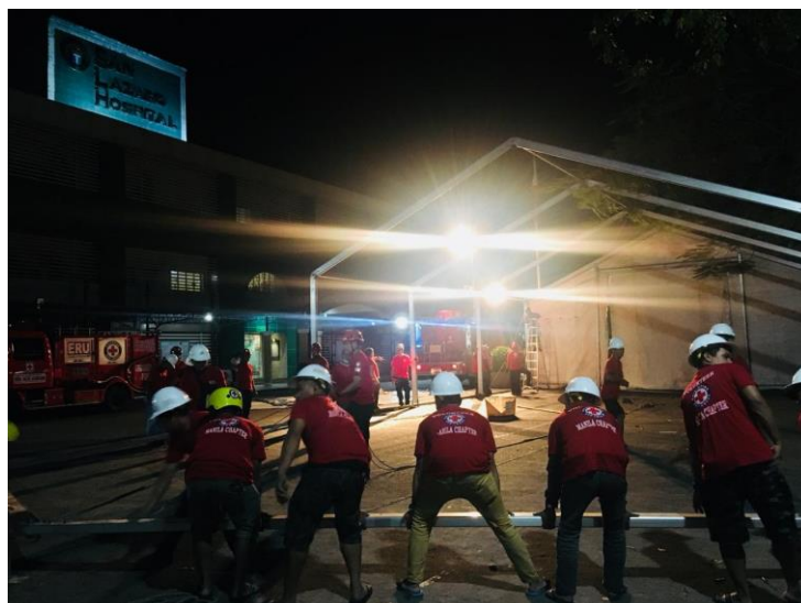
PRC set up the emergency hospital support centre in San Lazaro hospital, Manila - a referral facility for Infectious/Communicable Diseases. This is to support the San Lazaro Hospital for the influx of measles patients.

PRC has undertaken assessments in four more hospitals in NCR Manila and mobilizing resources to provide similar services in these hospitals.