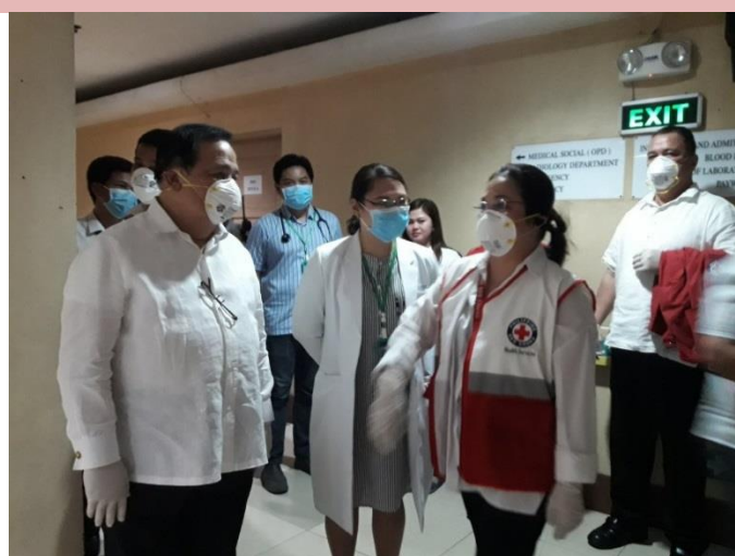
PRC Chairman and Deputy Secretary General visit San Lazaro Hospital in Manila to check the situation of patients following the declaration of measles outbreak. The visit aims to assess the status of patients, as well as explore possible areas of augmentation.

On 6 February 2019, the Department of Health (DoH) declared a measles outbreak in the National Capital Region (NCR) and Region 3 (Central Luzon). On 7 February, DoH