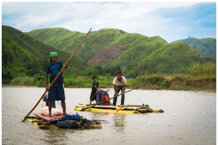
Beneficiaries from the indigenous group, the Matigsalug, use a makeshift raft from bamboo and banana trunks to transfer the corrugated iron sheets that will be used as roofing for households the PRC is supporting with shelter assistance. Access and transportation of shelter materials to the remote villages affected by Tembin is one of the challenges for the PRC recovery team and the families they are supporting, giving way to innovative but practical solutions to transfer the shelter materials from the supplier to the relocation sites.

Before TS Tembin made landfall, with support from the IFRC, PRC dispatched a standard set of non-food items to Mindanao for 1,000 families. Immediately after landfall, response teams (143 community-based Red Cross volunteers and chapter-based Red Cross action teams) were deployed for local response. National Disaster Response Team (NDRT) members including Water Search and Rescue (WASAR) teams were also deployed. PRC mobilized WASH hubs based in Mindanao with capacity for water treatment, storage and transporting. Coordination, assessment and response teams were deployed from the national headquarters to augment the chapter teams.