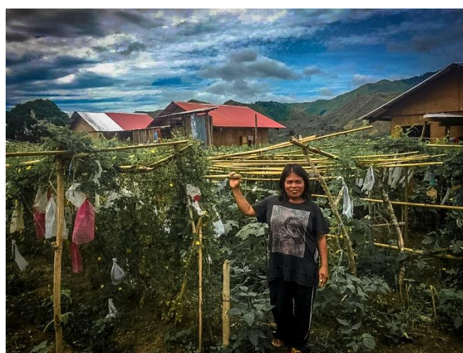
This beneficiary shows her vegetable produce from the seeds provided by PRC. Most of the beneficiaries set-up a backyard garden to plant the seeds.

Aside from the cash grant, the assistance was also complemented with the provision of vegetable seeds. A total of 750 households received these seeds in Bukidnon and Zamboanga del Norte. The seeds are aimed to support food security while they await the sale of their pigs and produce.