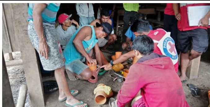
PRC technical staff are supervising the construction of pilot latrines and setting of septic tank at Sitio Kilantap, Barangay Kiulom, Kitaotao, Bukidnon. On the ground, they are also providing technical guidance related to the construction.