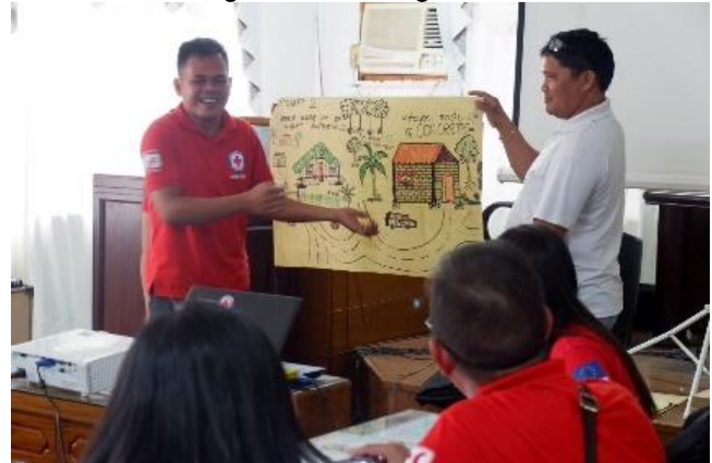
Presentations of community base maps during the PASSA ToT in April 2018.

In April 2018, a Participatory Approach for Safe Shelter Awareness (PASSA) workshop Training of Facilitators was conducted in Zamboanga del Norte for chapter staff and volunteers. There were 16 participants (six females and 10 males) attended the workshop. The workshop aimed to introduce the concept of disaster risk reduction by understanding about community hazards, risk, vulnerability and capacities. Communities in Zamboanga Province received shelter support by the Government and the training provided by PRC in safe shelter repair complimented this Government action.