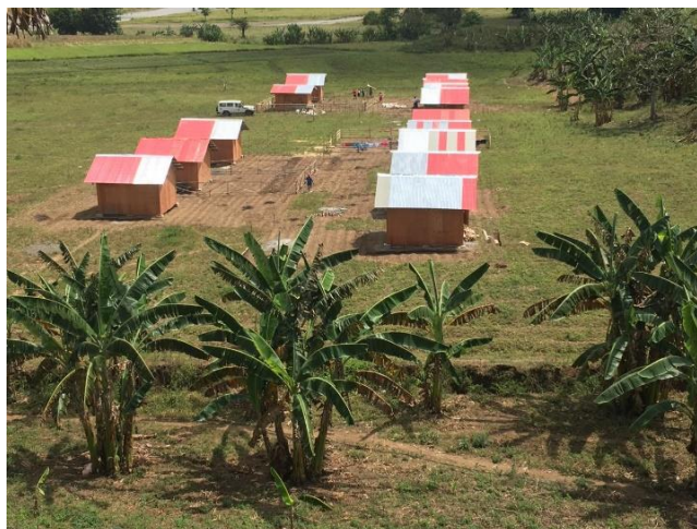
IFRC and PRC technical staff continue to do monitoring in shelter relocation sites in Bukidnon.

As of reporting, 355 shelters have been completed out of the 370 targeted in the barangays of Kitaotao, Bukidnon: 25 in Digongan, 125 in Kiolom, 166 in Panganan and 54 in Sinuda. Beneficiaries received a combination of PHP 27,000 (CHF 540) cash for shelter materials, 10 corrugated iron sheets and labour support paid directly to the carpenters and masons.