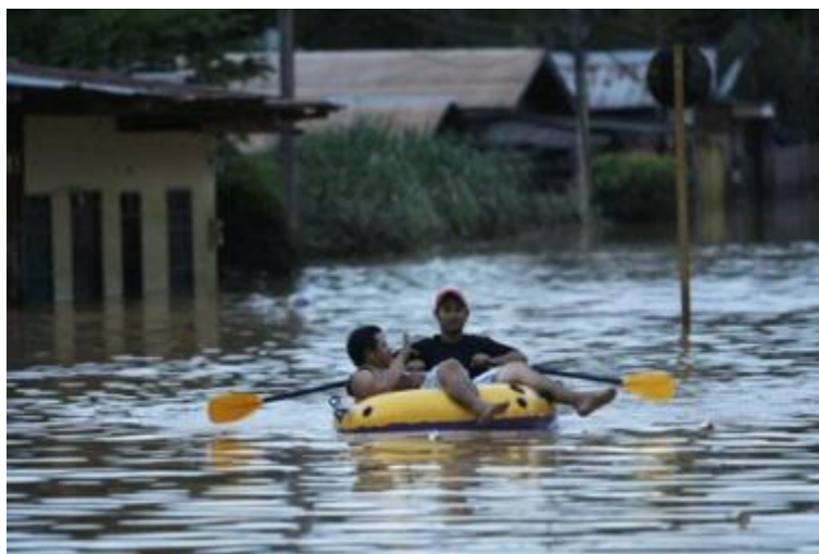
Men use a raft to navigate the flooded streets in Cobija, northern Bolivia, after severe precipitations caused by La Niña weather phenomenon.

Department of La Paz: preliminary assessments were completed by the Early Warning and Risk Management Unit (Unidad de Alerta Temprana y Gestión de Riesgo, UATGR) of La Paz Governor's Office. Assessments results indicate that the main negative impacts of the flooding in this department have been the loss of some 870 hectares of food crops and damage of infrastructures.