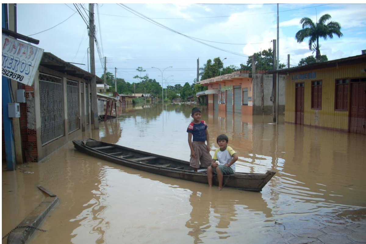
Heavy rains and widespread flooding have affected 107 municipalities in 9 departments in Bolivia.

116,138 Swiss francs have been allocated from the IFRC's Disaster Relief Emergency Fund (DREF) to support the Bolivian Red Cross (BRC) in delivering immediate assistance to 1,000 families (some 5,000 persons). Unearmarked funds to repay DREF are encouraged.