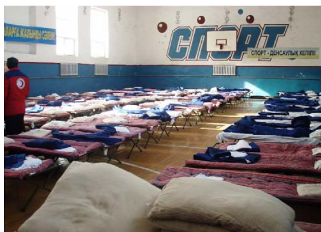
One of the three collecting centres set in Temirlanovka.

On 19 February the rapid needs assessments were conducted in Ordabasy and Arys districts by the National Disaster Response Team (NDRT) of the South-Kazakhstan regional branch (12 persons). In addition, 16 Local Disaster Management Committee members from the affected communities supported the NDRT with the assessment and distribution of humanitarian aid from the available stocks and also participated in the evacuation activities. The Red Crescent Society teams are continuously monitoring the situation that can evolve due to the change in the weather conditions.