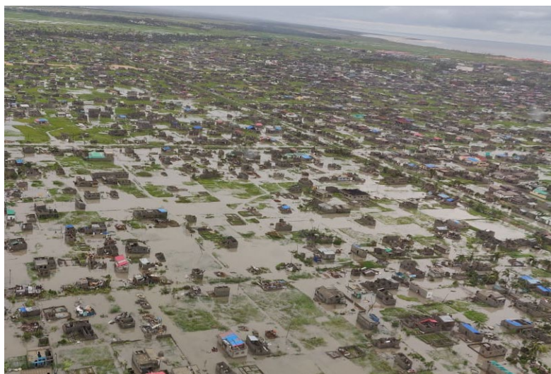
Aerial view of the destruction across Beira, Mozambique on 17 March 2019

19 March 2019: IFRC issues an Emergency Appeal for 10 million Swiss francs for 75,000 people for 12 months.