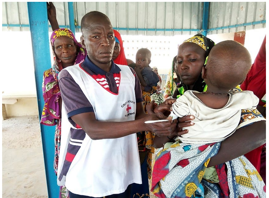
Photo: Community-based malnutrition screening by Red Cross volunteer

This revised Emergency Appeal results in a funding gap of 673,000 Swiss francs out of the total amount obtained since April 2018. The revised budget has been increased due to the growing needs of the affected population by food insecurity. The extension aims for the operation to continue the dissemination of epidemic prevention messages, provision of safe water and adequate latrines for an additional 12 months. The growing health risks have demanded for an expand in the geographic coverage of operations from a perimeter of 5 kilometres surrounding the 11 integrated health centres in Diffa region to nearby villages beyond the mentioned 5 kilometres perimeter. The planned response reflects the current situation and information available.