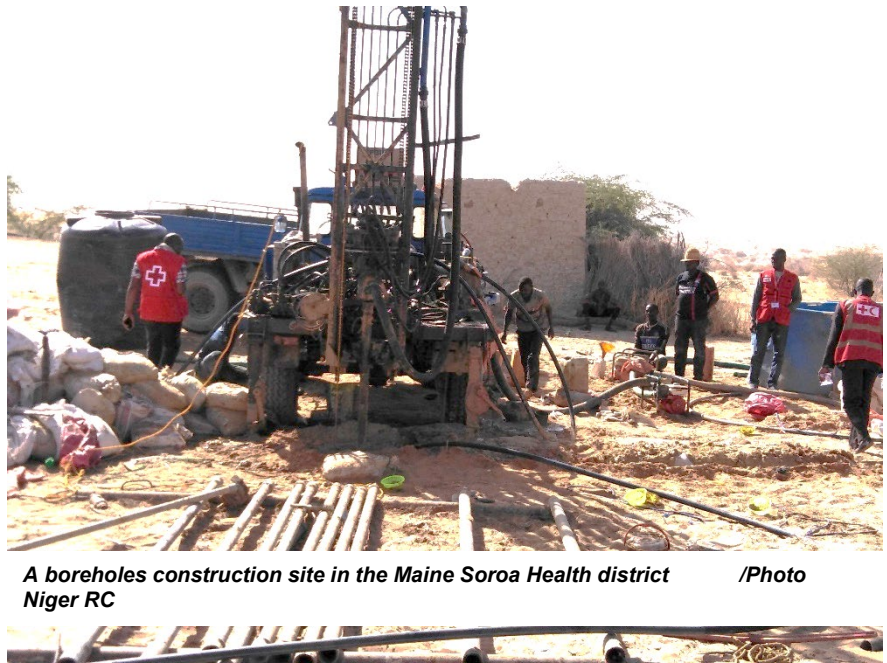
A boreholes construction site in the Maine Soroa Health district