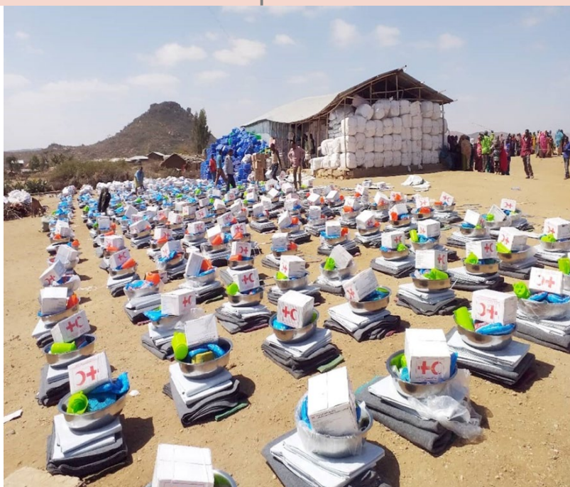
ERCS Volunteers distributing Household items to IDPs in Somali region.

April 2019: IFRC launches an Emergency Appeal for 5 million Swiss francs to support 80,200 people for about 9 months with a 400,000 Swiss francs DREF loan to start-up the response.