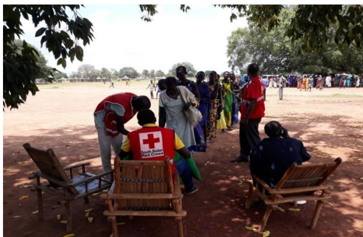
during verification in Aweil Centre

In 2018, through IFRC, SSRC received 10,000 kits in-kind donation from ICRC as part of the required resources for the Movement Response Plan. Following this, SSRC conducted rapid needs assessments and distribution of these NFI kits in Kapoeta East, Yirol East and Aweil Centre, targeting households affected by droughts, floods and internal conflicts. Ten thousand households were registered for essential household NFIs intervention. The NFI kits are combination of WASH and Shelter intervention and are based on the recommended SPHERE standards.