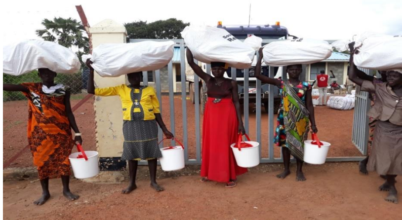
Photo: Women receives essential household items in

In 2018 through this response, SSRC provided life-saving and livelihoods recovery assistance in the target locations (Aweil East, Yirol East and Kapoeta East) through a timely and effective integrated package of Food Security and Livelihood, health, WASH, Essential household Items (EHIs), child protection and education services delivered through complementary responses. To ensure that support has a wide reach, services were delivered through the respective branches and units with further technical backstopping from the National Society departments. During the response phase, the following are the key achievements;