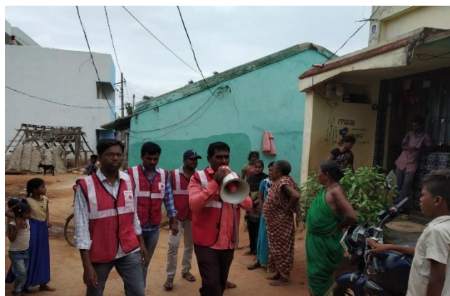
IRCS staff and volunteers on early warning campaign rounds

Two emergency control rooms (24x7) have been operational in the State Branch in the DM Unit to closely monitor all preparedness and relief activities in the vulnerable areas and in the Cyclone shelters. Odisha state branch functions such as DM Coordinator and other staff monitored and coordinated with SERV volunteers and different government agencies for all preparedness and response intervention. A quick action team consisting of 100 fully trained and equipped volunteers in the State Head Quarter were mobilized to be ready for deployment whenever necessary. Overall, more than 10,000 volunteers were active during the Cyclone Fani preparedness and relief operation. Central Red Cross Blood Bank is ready to meet any kind of exigencies during and post-disaster.