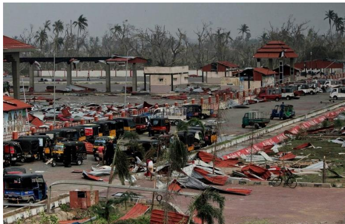
Corrugated sheets used as roofing lie scattered after Cyclone Fani made landfall in the area in Penthakata fishing village of Puri, in the eastern Indian state of Orissa, Saturday, 4 May 2019

While Odisha, West Bengal, and Andhra Pradesh states were affected by the cyclone, significant damage occurred in 6 districts of Odisha - Puri, Jagatsingpur, Kendrapara, Bhadarak, Cuttack and Bhubaneswar. In Andhra Pradesh, three coastal districts namely Vijayanagaram, Visakhapatnam and Srikakulam, received heavy rainfall. Most of the damage was caused due to high velocity winds.