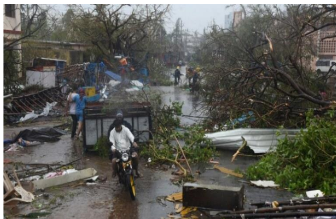
People move through debris on a road after Cyclone Fani hit Puri, in the eastern state of Odisha

While the storm weakened, on its way it caused heavy rainfall in the north east part of the country covering Assam, Arunachal Pradesh, Nagaland, Manipur states and light to moderate rainfall at most places over east Assam, Nagaland and east Arunachal Pradesh till 5 May 2019.