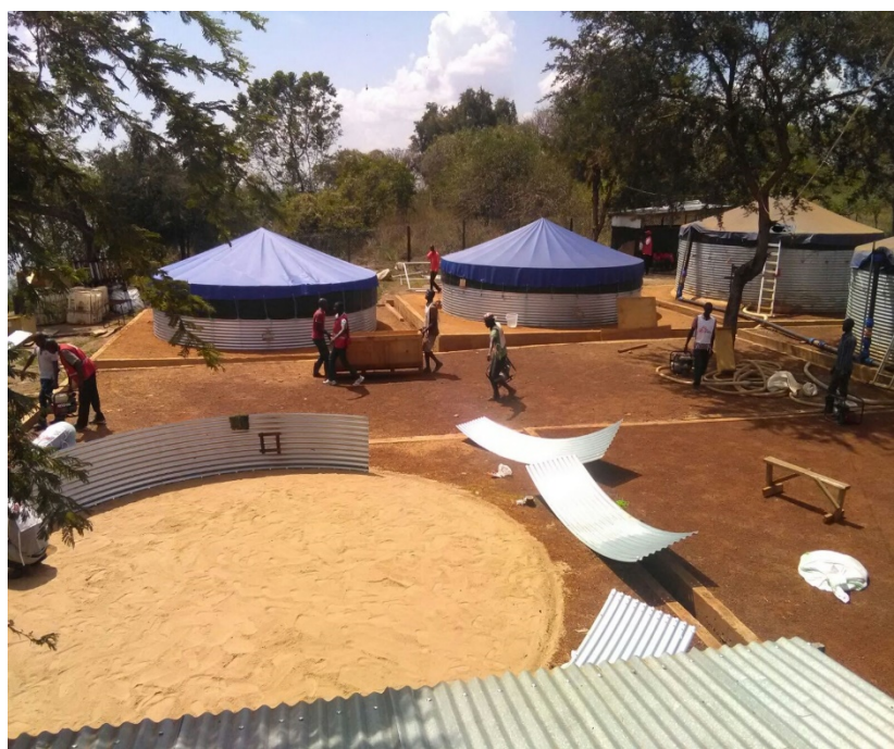
Angalia-Achini Water Treatment Unit, Palorinya refugee's settlement. URCS

2 Aug 2016: Bidibidi settlement opens in Yumbe District to alleviate overcrowding in other settlements. The IFRC is supporting Uganda Red Cross Society (URCS) to focus its response efforts in Bidibidi. Services and facilities in Bidibidi settlement are extremely under-resourced and are not sufficient to meet the basic needs of the current and projected population. The URCS, UNHCR and other agencies working in Bidibidi settlement are helping to address urgent basic needs in terms of water, sanitation and health.