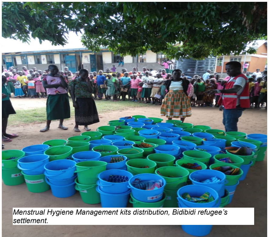
Menstrual Hygiene Management kits distribution, Bidibidi refugee's settlement.

3,885 MHM kits composed of reusable pads (3 maxi and 1 supermaxi), 7 litres plastic bucket, rope, pegs, laundry and bathing soaps, 2 underwear, Information Education and Communication materials and a storage bag were procured and distributed. Priority was given to adolescent girls and women of the reproductive age group 18-34 years. Particular importance was given to adolescent girls at school due to the high number of school drops out due to challenges in MHM, in addition to unavailability of appropriate sanitation facilities (latrines separate per gender and changing rooms). Therefore, out of 3,885 kits purchased, 528 were distributed in 3 schools in Bidibidi and 957 in Imvepi where URCS conducted hygiene and sanitation activities involving teachers, parents' committees and students. A post monitoring distribution survey aimed at investigating use, quality and purpose of use of distributed non-food items (NFIs) was conducted by the Community Engagement and Accountability (CEA) team in the month of September 2017 using a sample size of 775 people. Demonstration on MHM kit use and awareness sessions were conducted along with distribution campaigns. Selection of beneficiaries was based on OPM-UNHCR criteria, set together with WASH and Protection partners. Complementarity of actions was created with actors present in the field in order to respond to still existing needs avoiding overlapping in distribution of items.