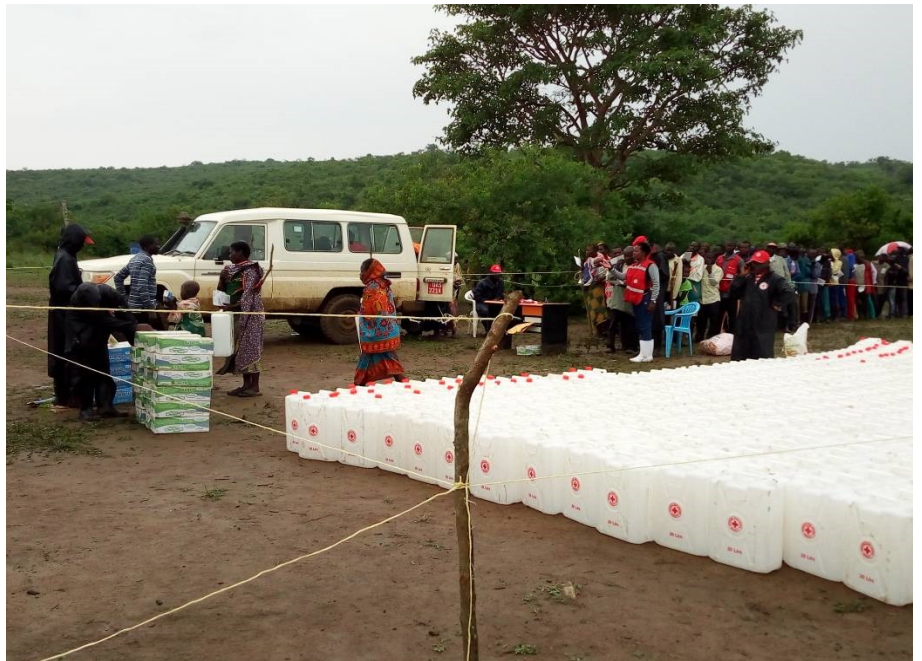
20 litres jerry cans distribution, Imvepi refugee's settlement. URCS

A post monitoring distribution survey aimed at investigating use, quality and purpose of use of distributed non-food items (NFIs) was conducted by the Community Engagement and Accountability (CEA) team in the month of October 2017, using a simple size of 851 Household.