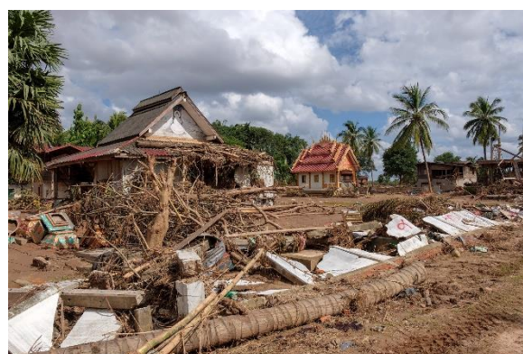
A house damaged by flash flood.

Following Son Tinh was the Tropical Storm Bebinca which hit the country only weeks after. According to UN Information Bulletin No. 5 , all provinces in Lao PDR have been affected, including 2,382 villages, 126,736 households, and 616,145 people. A total of 1,779 Houses were destroyed and 514 damaged. 90,000 ha of paddy fields and 11,000 ha of other plantations have been destroyed, and 630 km of roads and 47 bridges have been damaged, report says. According to the findings from the ongoing Post-Disaster Need Assessment (PDNA) conducted by Laos' Ministry of Labour and Social Welfare, and facilitated by the UN, World Bank, and the EU, total damage reportedly added up to USD 147 million, while the total loss added up to USD 225 million. The most affected sectors overall are agriculture and transport, which contribute to 90 per cent of damages and losses. The most affected provinces are Vientiane Capital, Khammouane, Huaphanh and Attapeu. Attapeu is most affected per capita. As the floods have increasingly affected also other parts of the country, the Humanitarian Country Team has enhanced the Disaster Response Plan by expanding the focus of the operation from Attapeu to cover the entire country. The Lao Red Cross will be responding according to the original plan. This Emergency Appeal operation remains focusing on Attapeu flash flood response and recovery.