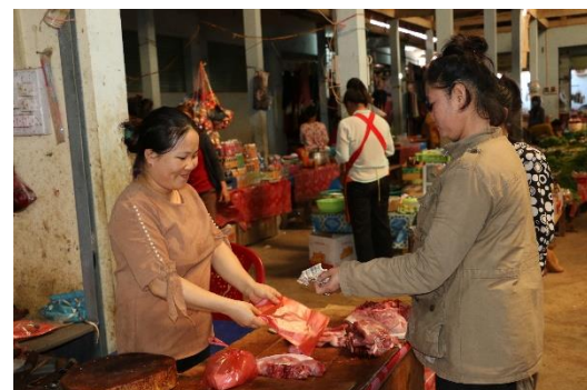
Recipient of cash distribution uses the grant to buy meat from the market.

As a direct support to LRC, Thai Red Cross Society (TRCS) contributed food relief kits to 1,309 families since the beginning. During January 2019, LRC has completed food distribution, in collaboration with WFP, to 5,398 people (1,085 households) in seven villages (Sompoy, Pindong, Nongkhae, Phonsad, Had-Oudomsay, Saydonkhong and Tamoyod) under Sanamxay district. Therefore, the target beneficiaries of food items under the EA has been reduced from 1,500 to 500 households which has already been achieved.