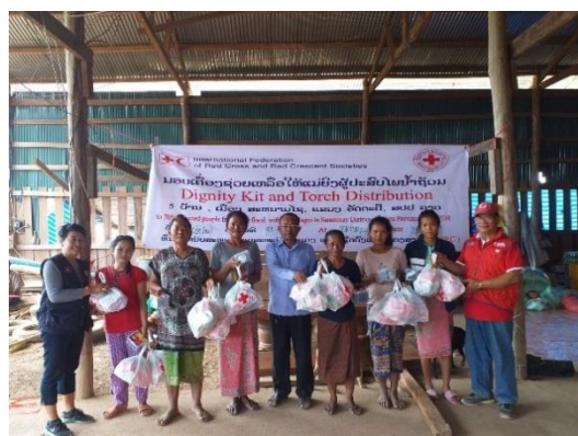
Distribution of dignity kits and torchlights to 814 households in December 2018.

Through bilateral support to LRC, German Red Cross (GRC) assisted the Shelter component of the Emergency Appeal (EA) during the emergency phase, under which tarpaulins and shelter tool kits were given to 1,000 families, along with the shelter orientation. With the above distribution by GRC, IFRC later reduced the number of its own target recipients of tarpaulins and shelter tool kits under the EA from 1,500 to 500 households, while maintaining the number of beneficiaries at 1,500 households. GRC agreed to lead the implementation of these distribution together with providing shelter orientation. IFRC provided logistics arrangement such as the erection of GRC warehouse tent and delivered relief goods to distribution points.