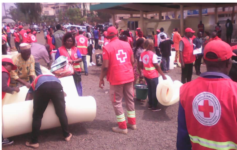
Distribution of HHIs in Menoua division, West region © Cameroon Red Cross

May 2019: IFRC launches Emergency Appeal for 2 million Swiss francs to support 35,000 people for 6 months.