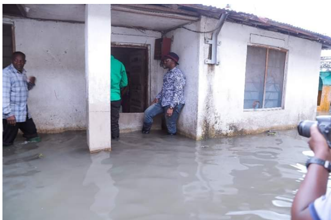
Picture 1: Dar es Salaam Regional Commissioner visited affected families in Kinondoni Municipality

The flooding has caused displacement of people, who are hosted by friends as well as in temporary public buildings, mainly schools, mosques and churches. A total of 1215 HH have been displaced (from the 1560 HH affected). There is a widespread destruction of physical infrastructure, particularly roads and bridges, some of which have been completely damaged/broken, interfering with communication between neighbouring places within and outside the municipality. The flooding has caused significant damage to houses and has swept away personal household items and belongings as well as other properties including poultry.