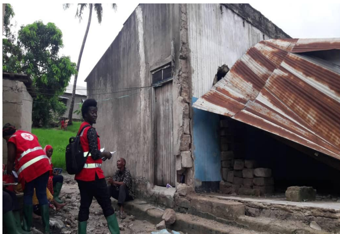
TRCS volunteers conducting the initial rapid assessment

The floods caused a significant impact to the people in Dar es salaam leading to damage of properties and livelihoods and putting the affected population at risk of diseases. The initial rapid assessment conducted by TRCS from May 20 to May 23 rd , indicated that the heavy rains have caused serious flooding in Kinondoni, Temeke and Ilala municipalities of Dar es Salaam. The rains which fell upstream affected eight (8) out of twenty-seven (27) wards of Kinondoni municipality, eleven (11) out of twenty-four (24) Wards of Temeke municipality and eight (8) out of twenty-five (25) Wards of Ilala municipality. The initial rapid assessment conducted by TRCS volunteers reported the following impact: