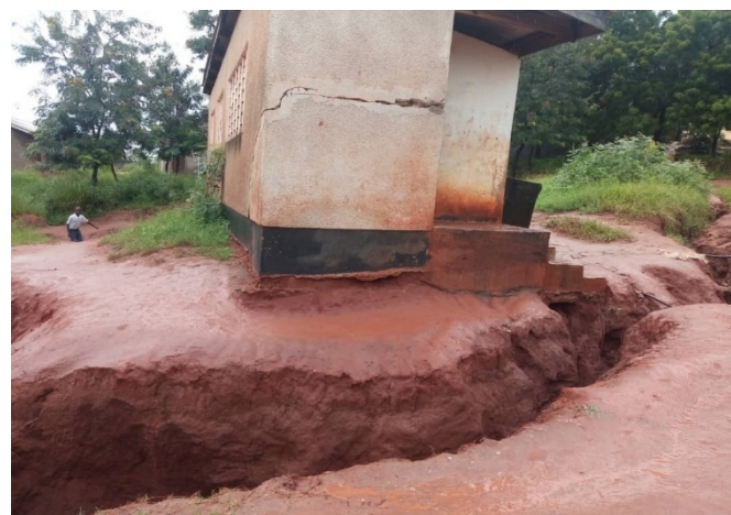
Picture 2: School impacted by floods in Kinondoni municipality

In view of the above, Tanzania Red Cross Society (TRCS) is seeking CHF 125,828 from the IFRC Disaster Relief Emergency Fund (DREF) to meet the immediate needs of the flood affected population in the three affected districts of Dar es Salaam (Kinondoni, Temeke and Ilala municipalities). The operation will focus on the distribution of household items (HHIs) as well as provision of WASH and Health needs, targeting a total of 500 households (2,500 people) affected by the ongoing floods in Dar es Salaam.