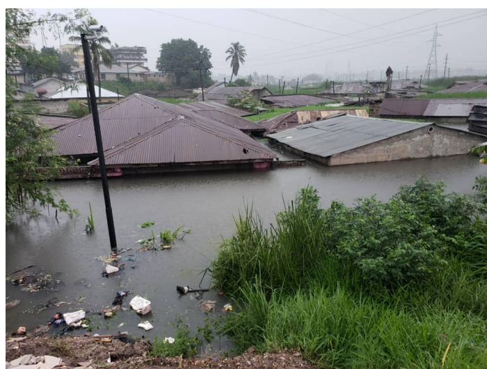
Submerged houses in Kinondoni Municipality

Heavy rains were reported in Dar es Salaam, starting on 8 May 2019 to-date. According to the Tanzania Meteorological Agency (TMA), these rains are a result of the Inter-Tropical Convergence Belt and led to continuous rainfall and resulting flooding which peaked on 13 May 2019. According to IGAD Climate Prediction Application Centre (ICPAC), much of southern and eastern Tanzania recorded wetter than normal rainfall condition with a few places in southern and eastern Tanzania recording severely to extremely wet rainfall conditions between 1 st and 10 th May 2019. On 23 rd May 2019, the TMA issued a weather information update stating that rains will continue with significant impact; floods, fishing activities to be interfered, transport network impaired, socio-economic/livelihood will be damaged and increased risk of waterborne and vector borne disease outbreak.