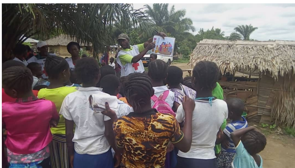
Awareness in Nkolo

The health sessions in the localities were very much appreciated by the populations and the territorial authorities who wished that this Red Cross support could continue further because they facilitate the return of displaced populations. The lack of safe drinking water is also an important factor that requires the strengthening of awareness sessions on hygiene and water purification in the homes.