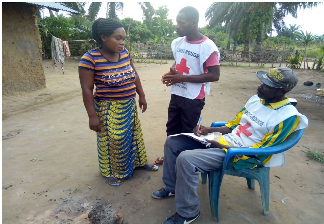
Psychosocial session by two volunteers from the DRC RC for a return of Yumbi

The need for mosquito nets, especially during this rainy season, is greatest in the host islands and in Bongende. When taking into account the populations of Bongende, the kit to be distributed should contain mosquito nets. Some 18 volunteers, including 12 in Yumbi and 6 in Nkolo, have been trained in psychosocial care and are leading care sessions in this regard.