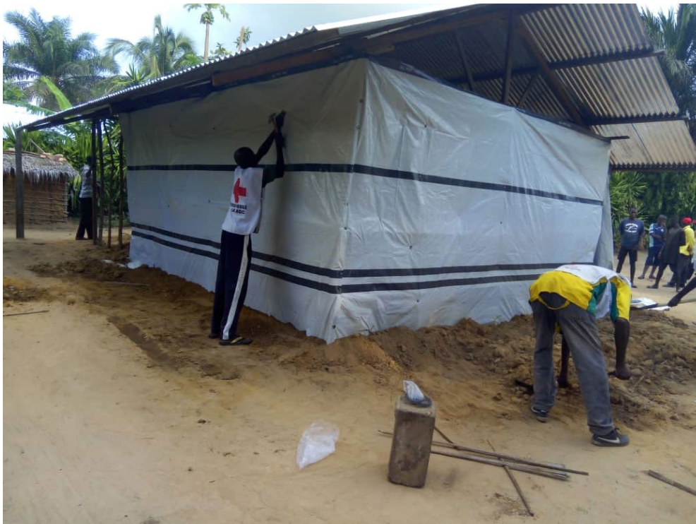
Type of shelter in construction in complementarity with the Military Engineering (roof built by Military Genius and walls built by the Red Cross).