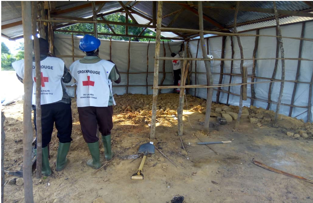
These Volunteers of the DRC RC are completing the construction of a shelter tolerated by the Military Genie

on May 11, 2019. Considering the delay in our equipment due to the difficulties encountered in their delivery and in a spirit of complementarity, DRC RC has decided to work together with the military engineer by providing sticks and tarpaulins for the construction of the wall (this participation of households being difficult, given the lack of financial and material resources) and the military engineer provides the roof for our 600 targeted households. Since the Military Engineering finished its work in Yumbi center after the construction of the roofs, 450 shelters were built. Of the shelters built by Military Engineering, 250 have been selected for Red Cross action. The ten (10) volunteers trained on the construction of the shelters were recycled and 03 control shelters were built in Yumbi (see photo below).