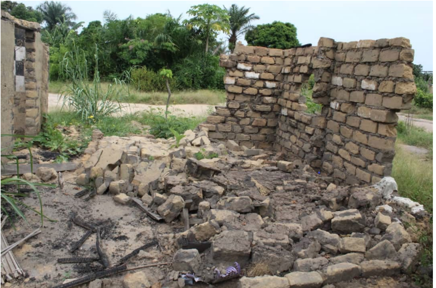
Example of a house destroyed during clashes between Nunu and Tende (Bongende village)

The Yumbi crisis has caused a social divide between the two communities. They currently live in separate areas in which each community is larger in number (Nunus on the islets / Yumbi and Tende in the localities of the Yumbi-Bolobo axis).