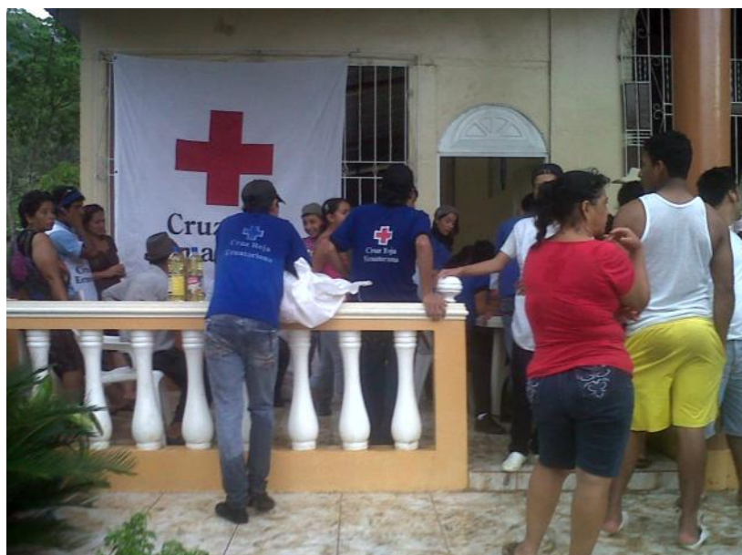
Since severe precipitations started in Ecuador early in the year, the Ecuadorian Red Cross (ERC) has reached some 2,000 families affected by floods and landslides.

The major donors and partners of DREF include the Australian, American and Belgian governments, the Austrian Red Cross, the Canadian Red Cross and government, Danish Red Cross and government, the European Commission Humanitarian Aid and Civil Protection (ECHO), the Irish and the Italian governments, the Japanese Red Cross Society, the Luxembourg government, the Monaco Red Cross and government, the Netherlands Red Cross and government, the Norwegian Red Cross and government, the Spanish Government, the Swedish Red Cross and government, the United Kingdom Department for International Development (DFID), the Medtronic and Z Zurich Foundations, and other corporate and private donors. The Belgian Red Cross and Belgian government, and ECHO have replenished the DREF for the allocation made to this operation. The IFRC, on behalf of the Ecuadorian Red Cross, would like to extend thanks to all for their generous contributions. More details on contributions can be found at http://www.ifrc.org/what/disasters/responding/drs/tools/dref/donors.asp