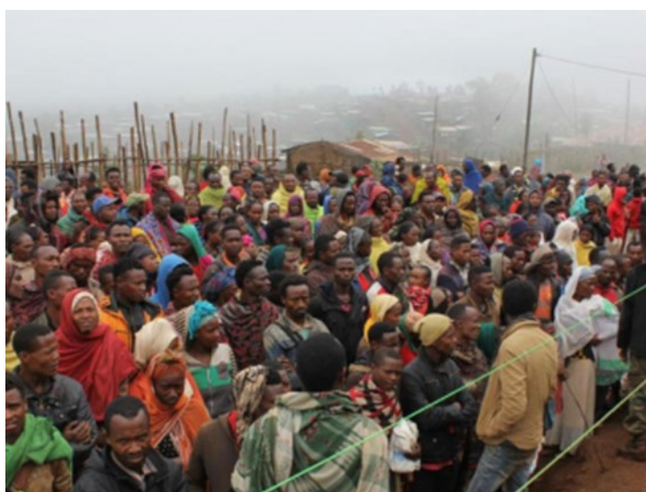
Locally displaced population

This DREF operation was launched on 28 August 2018 to address the needs of IDP populations affected by the clashes which occurred in August 2018 between Somali and non-Somali ethnic groups in the Somali region. This conflict caused the displacement of 52,000 people from different zones including Babile Somali and Tuluguled. In December 2018, an Operation Update was published, extending the operation by two months, until 28 February 2019. This extension was approved to allow completion of activities which had been delayed due to procurement. These clashes have now ceased but the needs of the displaced population have still not been fully addressed.