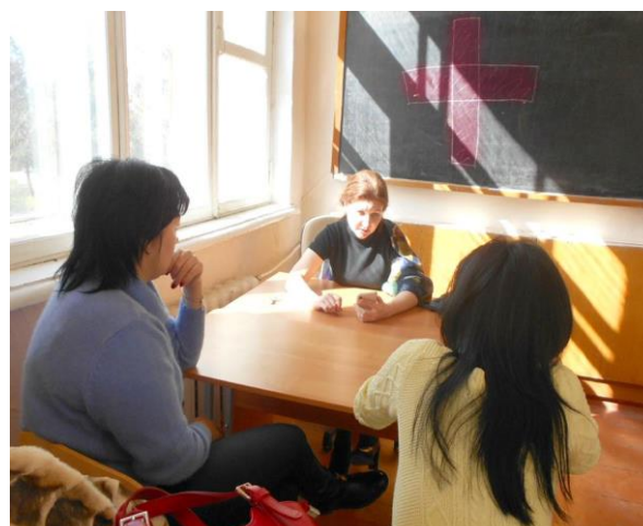
Image 3. Individual PSS session rendered by Red Cross.

In total, 4,963 interventions have been undertaken in November 2018 – April 2019, including 2,648 home visits and individual meetings with beneficiaries, 882 calls from 534 people affected by the attack in the college were received via 24/7 psychosocial hotline which is available on three mobile phone numbers; 161 people received social support, 106 orphans (college students) received psychosocial support in the college hostel, 151 PSS meetings with 106 families were conducted in the Red Cross branch, 146 people were referred to medical institutions to receive professional mental health services. In February-April 2019, 484 group PSS meetings and 520 meetings individual meetings were conducted in the Kerch college for students and teachers. PSS team organized 120 meetings with student leaders, 5 events "Lessons of Mercy", 8 meetings with the college administration and teaching staff, 3 groups on the first psychological aid (32 people).