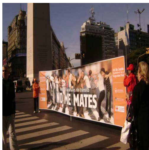
The ARC conducted public education on issues of road safety, which includes respect for pedestrians.

During the first part of the year, the ARC started its road safety activities that concentrated on raising awareness and disseminating information about the issue. ARC volunteers used creative interventions to draw attention to the issue such as giant mobile banners on pedestrians' right of way held up at busy urban intersections, handing out educational pamphlets in public locations, giving talks to promote first aid for drivers, designing road safety manuals that with State funds will be distributed in all vehicles sold in the country. The ARC, in coordination with the government, commemorated the Day for Victims of Traffic Accidents over two days in June. The National Society has approved and started implementation of a Road Safety Plan for 2011-2015 and participated in the Road Safety Alliance, as well as developed and implemented its psychosocial support programme for victims and family members of traffic accidents.