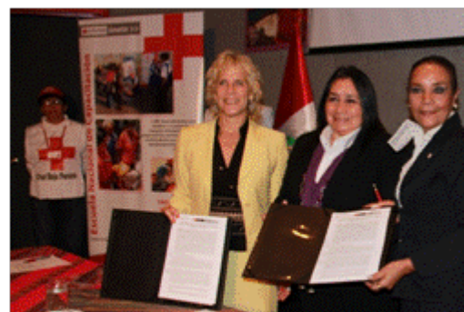
The PRC has signed an agreement for training in first aid to all day-care centres in Peru.

The PRC is partially implementing these plans due to the lack of funds and will do so until the National Society has the capacity to develop a Resource Mobilization Strategy in line with its new National Strategic Plan. In June 2011, some results were seen thanks to the campaign to support families affected by the cold wave organized in alliance with a local television channel. Furthermore, in November 2011, the PRC signed an agreement with the Ministry of Women and Social Development for training in first aid to all day care centres "Wawa Wasi" in the country; this will represent an annual income of around 40,000 Swiss francs.