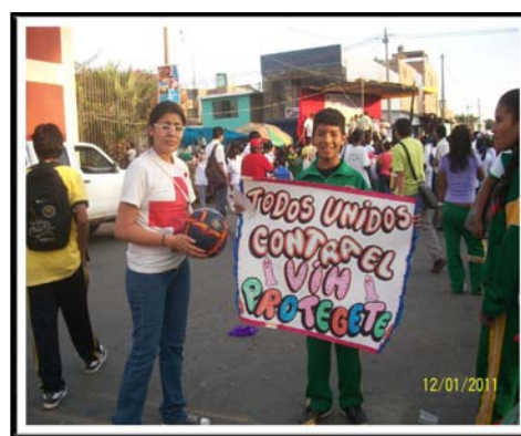
Volunteers in an activity to raise awareness and promote prevention of HIV in Nazca, Peru.

was implemented in addition to volunteer training which has enjoyed support from students at higher education institutes. In November, in the city of Nazca a peer-training workshop was held jointly with the Peace Corps. This workshop, called “Promoting the Prevention of HIV and AIDS,” trained peer educators who had been pre-selected from the fourth and fifth grades of six secondary schools. Nazca province municipality also offered logistic support for this activity.