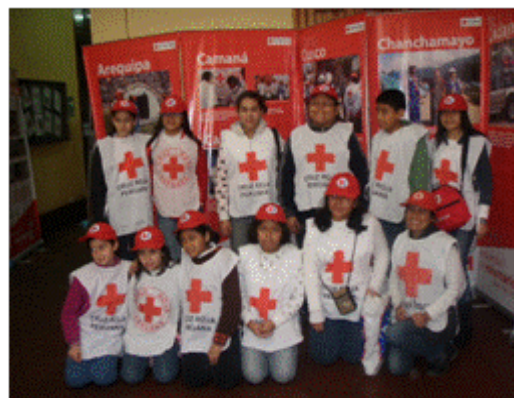
AIV+10 campaign advocated for volunteering in Peru.

The PRC, with support from the regional representation and the Finnish and Swedish Red Cross Societies, has been developing the design of its volunteering management cycle (including specific strategies for the management of youth volunteers), volunteering policy and code of ethics. This will serve as a foundation for the establishment of the volunteering management cycle and the revision of the Statutes. The development of these initiatives has been extended into March 2012 and will be supported by the PRC-IFRC-DFID integrated development project through the remainder of 2012.