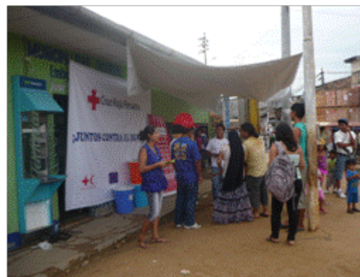
The PRC worked to reduce the impact of the dengue epidemic in Peru.

Regarding health emergencies in 2011, the DREF and OCHA Project funds were used for work in dengue prevention in the Loreto region, Maynas province, and the San Martín region. Additionally, specific activities were carried out, such as the distribution of informative materials and prevention activities in certain cities in the departments Madre de Dios, Ucayali, Lima and Piura. The PRC reached 55,175 people through the DREF, 48,563 people (with PAHO-OCHA funding) through house visits and community campaigns with a focus on prevention and work in schools, in coordination with the Regional Health Offices (DIRESA).