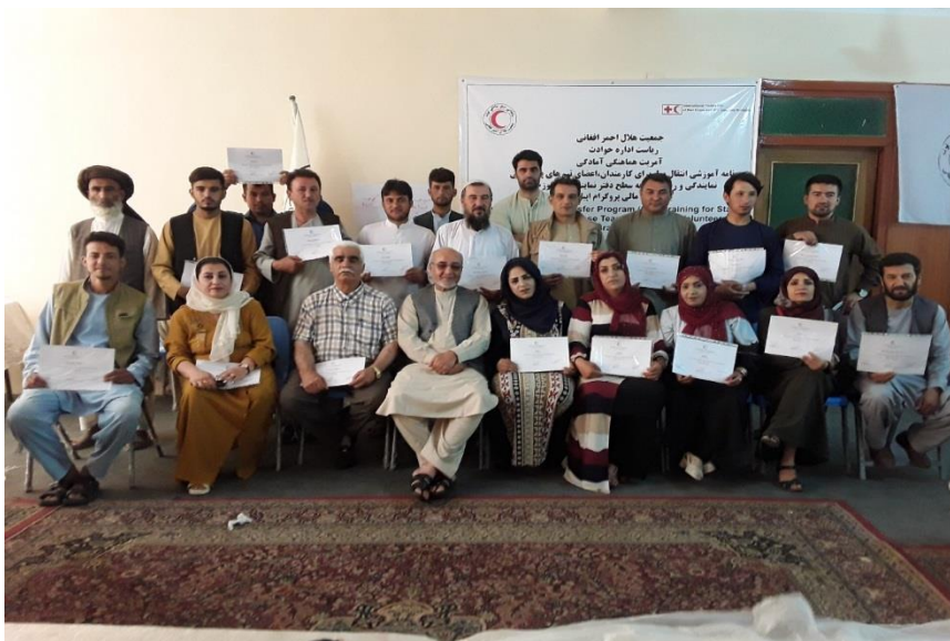
Participants of the Cash transfer training in Jawzjan province.

The procurement of additional food parcels has already been commenced. The 6,000 food parcels have been sourced out locally and procurement process has been completed. However, the quality assurance of the food items is in final process, once the lab test will be received accordingly to the quality standard. After the completion of process food parcels will be transported to target provinces and deliver safe products to the affected families.