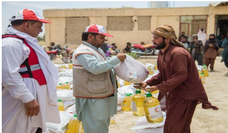
Food items distribution in Helmand province.

ARCS has utilized available prepositioned stock from Kabul and regional warehouses to support flood affected families in 20 provinces. ARCS rapidly responded to 1,500 affected families with food assistance in Herat, Farah and Helmand during March, these food parcels were replenished under DREF response to drought affected families. Later, in April 1,000 food parcels transported to Helmand for flood affected households. ARCS is also supported by ICRC and other Movement partners for food interventions to assist drought and floods affected families.