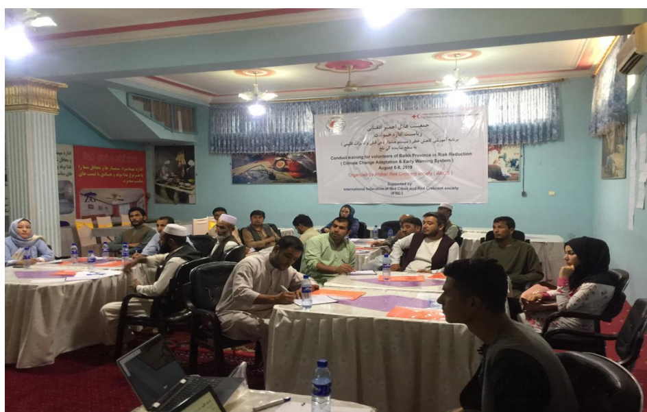
ARCS staff and volunteers training on disaster risk reduction & climate change adaptation in Balkh province.

Approximately, 62 participants (58 male and four female) attended the training course, including ARCS branch staff, and volunteers from three provinces. By providing a platform for discussion and sharing, the training course aimed to enhance the understanding of disaster risk reduction and climate change adaptation planning processes through capacity building for local staff and volunteer to further conduct the sessions in the community level.