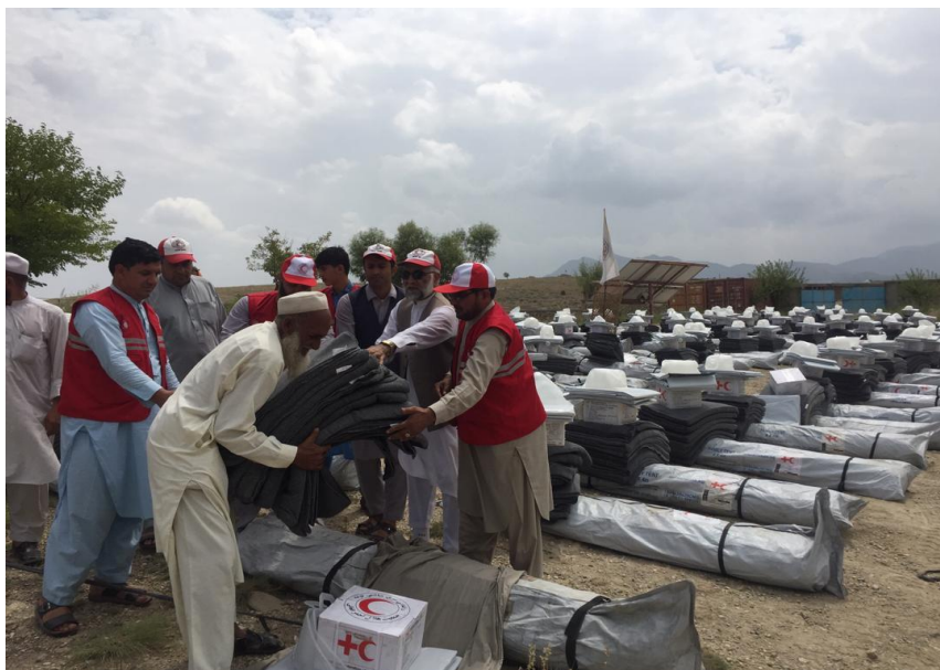
Emergency shelter & non-food household items distribution in Nangarhar province.

During the registration, the volunteers and chief of the local communities reconfirmed the targeted individuals if he/she met the criteria of registration, then he/she will be legible to be registered. Since, the distribution was targeting the floods affected families, it was agreed that only those who are given token during the registration could come and received the items. In order to minimize the number of unwanted crowds, when the chance of beneficiary come, he/she proceed to the table for signing/thumb impression against their name and after that the token is punched to ensure the beneficiary passes through screening point and finally proceed to receive the items. Beneficiaries were also allowed to check their items before the leaving the distribution point to ensure they have all the items in the kit. ARCS visibility was ensured by all staff and volunteers for easy recognition. The remaining 500 families will be support with emergency shelter in Balkh province in second week of September 2019.