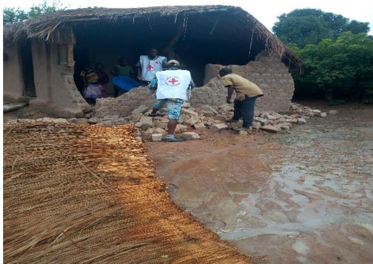
Photo 3: Volunteers to help the vulnerable to collect the rest of their belongings to join host families

Immediately after the end of the rain, the Sous-préfet of Paoua and the President of the Special Delegation of the city of Paoua with officials of the local committee of the Central African Red Cross (CARC), conducted a field visit to observe the extent of the damage and sympathize with the affected households. The President of the Sub-Prefectural Committee of Paoua mobilized 25 volunteers who were deployed in all affected neighbourhoods to assess the extent of the damage and register the victims. These volunteers provided much needed support to the injured and helped people with special needs to vacate their flooded homes.