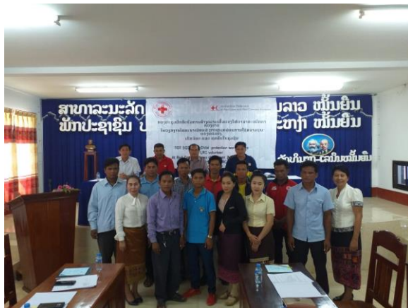
SGBV Prevention and Child Protection training conducted for Lao Red Cross volunteers in Attapeu during 2-4 May 2019

The assessment and survey resulted in further narrow down the number of target beneficiaries for shelter repairment to 315 households and Latrines to 519 households (i.e. latrine construction for 456 households and latrine repairment for 63 households) spread over 10 villages: Thaouan, Donmuang, Donbok, Pindong, Tamoyod, Had-Oudomsay, Sompoy, Hadyao, Tangao and Hinsombat. The assessment also identified 557 households those need livelihood support specifically Pig rearing (for 123 families), Poultry farming (for 431 families) and kitchen gardening (for 03 families).