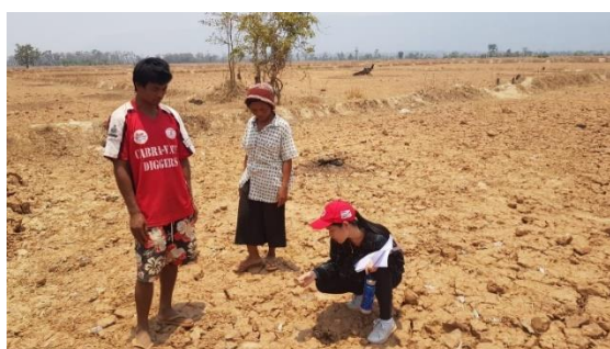
April 2019: Villagers show the assessment team their farmland still buried under mud nine months after the dam collapse.

The planning workshop was an opportunity to discuss and update the needs of the beneficiaries 03 (three) months after the disaster and compared between the actual needs and EPoA activities which had been planned 03 (three) months ago. The workshop participants included LRC HQ technical staff who have been involved in the operation from its onset, LRC Attapeu chapter staff and IFRC (Acting Head of CCST, PGI Officer and Surge Operations Manager). The topics covered shelter, livelihood, health, WASH, DRR and PGI. At the end of the one-week workshop, the participants identified their respective activities and took part in the field assessment to review whether these activities are still relevant for the current situation or not.