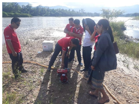
Lao Red Cross Attapeu branch staff were given training on Emergency WASH during 27-28 June 2019

The operation has mobilized a number of RDRT members within the RCRC Movement such as the International Committee of Red Cross (ICRC) Regional Office in Bangkok, the IFRC Country Cluster Support Team (CCST) Bangkok, and IFRC Asia Pacific Regional Office (APRO).