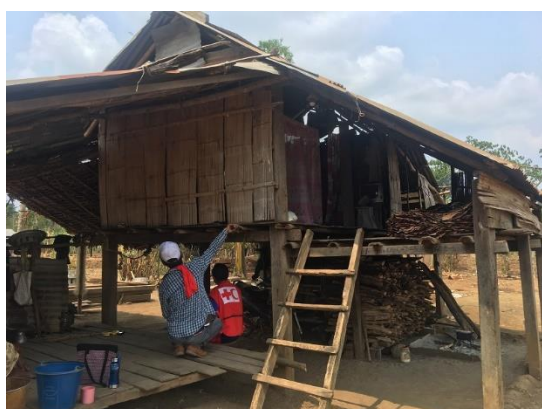
Shelter need assessments conducted in April 2019.

LRC has recently identified the target areas internally, hence it requires proper dialogue and coordination with provincial and municipality governments as well as each of the village leaders. In the meantime, coordination with humanitarian implementing partners is imperative to ensure no duplication in the support.