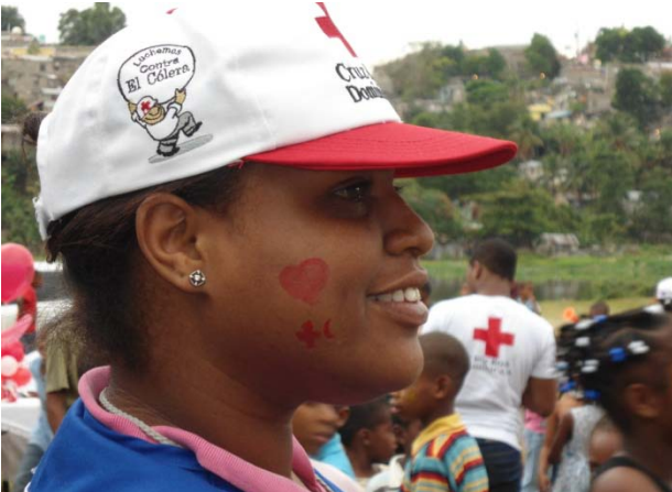
A Dominican Red Cross volunteer participates in a cholera prevention campaign with children.

During the second phase of the operation, as of 15 November, 190 volunteers had been trained at country level. Despite some delays in the process of fund transfers and purchases, the DRC pre-positioned awareness materials in the target areas.