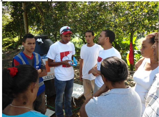
Volunteers of the Dominican Red Cross carrying out activities to promote health information to avoid Cholera.

The DRC has worked within the national disaster management system, promoting the Information, Education and Communication (IEC) strategy and messages agreed with the Ministries of Health and Education as well as the Humanitarian Working Group in country that includes UNICEF, OCHA, UNDP, AECID and ECHO. The National Society capacity in "health in emergencies" has been strengthened through this process.