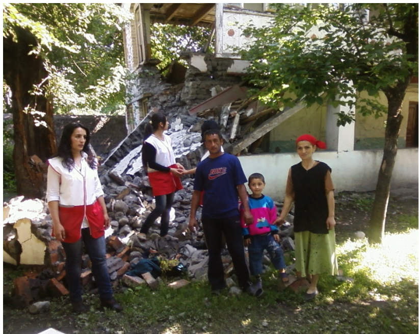
Family from Zagatala who has house was damaged due to earthquake. Red Crescent volunteers are estimating the level of damage and needs of this family.

Summary: The earthquake measuring 5.6 on Richter scale struck the south-western part of the country in Zagatala and Gakh, on 7 th May 2012. As a result 3,124 houses and public buildings were either destroyed or damaged. Following this earthquake strong and regular aftershocks were again registered in both Zagatala and Gakh regions. On 18 th May another earthquake hit the region with a magnitude 4.8. Due to the aftershocks and the latest earthquake the number of destroyed and damaged buildings has been increased.