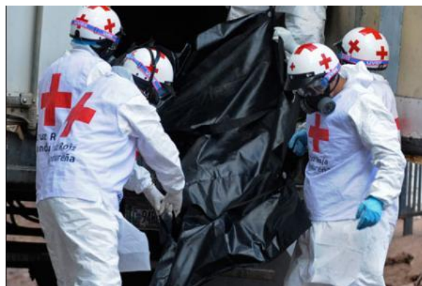
Volunteers of the HRC were a fundamental part in the management of bodies after the disaster.

The National Society, aware of the magnitude of the emergency, and bound by the Fundamental Principles and Humanitarian Values of the International Red Cross and Red Crescent Movement, developed its response capacity to offer a strong internal coordination between its different departments and branches. The HRC efficiently activated five branches: Comayagua, Tegucigalpa, Siguatepeque, Taulabe and Jesús de Otoro, all from the country's central region. More than 35 volunteers worked for 18 hours continuously during the event.