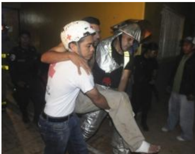
Multi- institutional teams assisted with evacuations and relief activities during Comaguaya's penitentiary fire, Honduras.

http://www.ifrc.org/what/disasters/responding/drs/tools/dref/donors.asp