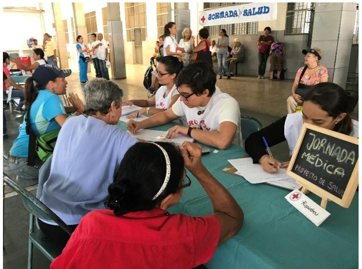
The VRC holds community health days in different locations throughout the country.

During the reporting period, most medical supplies were distributed in public hospitals, VRC hospitals and outpatient clinics. The delivery mechanism for medicines in VRC health centres is designed to ensure that the most vulnerable people are reached in a standardized and effective manner. Under the adopted model, community health sessions are organized in which patients receive a range of medical services and are provided with the necessary medicines free of charge. When necessary, patients are referred for further free treatment at VRC health centres and/or other public or private health centres, on a case-by-case basis. In some of the VRC clinics, pharmaceuticals are distributed free of charge to the population with a prescription from public health centres or other free health centres. As mentioned, public hospitals prescribe medicines according to their regular protocols and the technical committee reports on the use of medical stocks and the people who benefit directly from support via this Appeal.