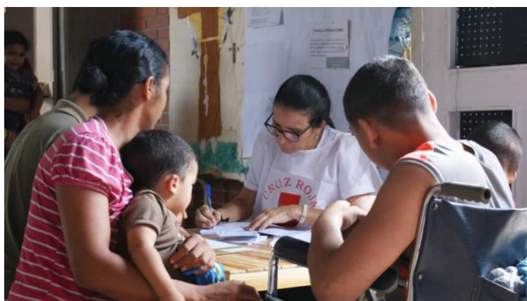
The Venezuelan Red Cross provides primary healthcare in community health sessions.

August 2019: Publication of Operation Update no. 1 .