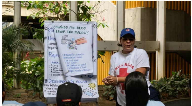
VRC volunteers give handwashing workshops at the community level.

A total of 17,931 people were reached with actions to promote water, sanitation and hygiene at the community level. This entails those reached with the distribution of water jerrycans and water purification tablets (Aquatabs), as well as the of workshops to promote hygiene and access to safe water in the Miranda, Aragua, Carabobo, Falcón, Yaracuy, Lara, Barinas, Vargas, Anzoátegui, Sucre, Zulia and Táchira states during this reporting period.