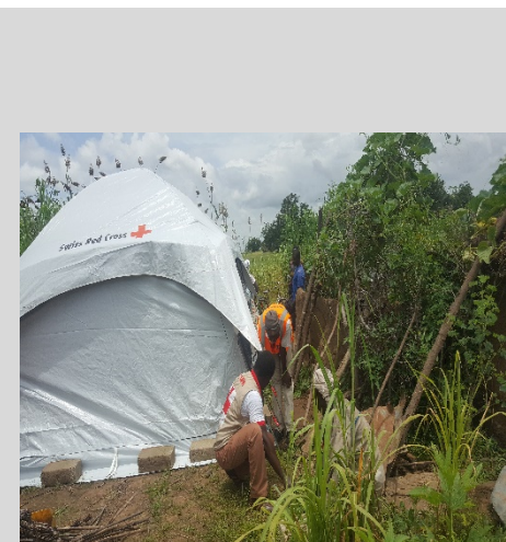
Provision of emergency shelter