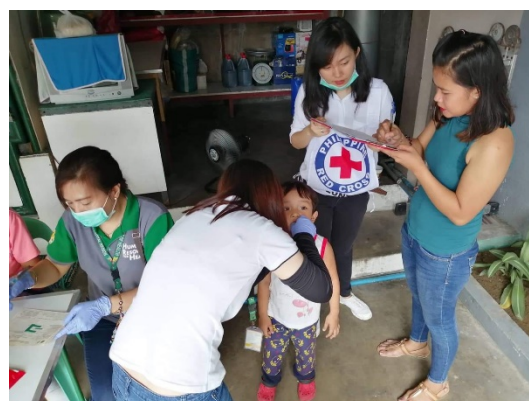
PRC vaccination team visits a family and administers vaccination.