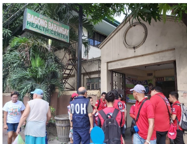
PRC assembling at health centre with DoH to coordinate on the communities to be vaccinated for the day – 26 Oct Manila City.