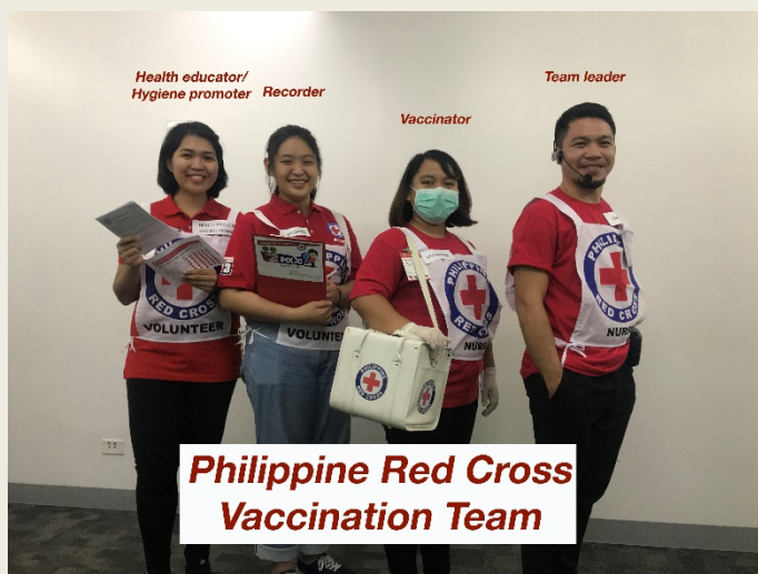
The PRC vaccination model team used to train PRC staff and volunteers.

The appeal will support PRC's epidemic preparedness activities. This will work in close collaboration with all the relevant services, NLRC's 510 secretariat and PRC's OpCen to strengthen PRC's outbreak response and management preparedness at the national headquarters (NHQ) and chapters. This initiative will closely work with other partners including DOH, WHO and UNICEF to ensure a coordinated and technically accurate approach. This initiative will also serve as demonstration and learning centre in the Asia Pacific region for knowledge management and dissemination of learning in relation to epidemic preparedness, data governance and coordinated response.