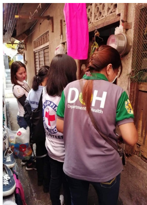
PRC in coordination with DOH going house to house to vaccinate children.

The following schematic intends to encompass the phases and initiatives with the basic information, in a holistic manner.