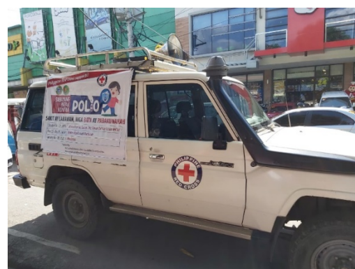
PRC car with loud speakers in Manila City 26 Oct giving communities information on vaccination for polio.

PRC has received a formal request from the DOH, Government of the Philippines to support their efforts in measles and polio