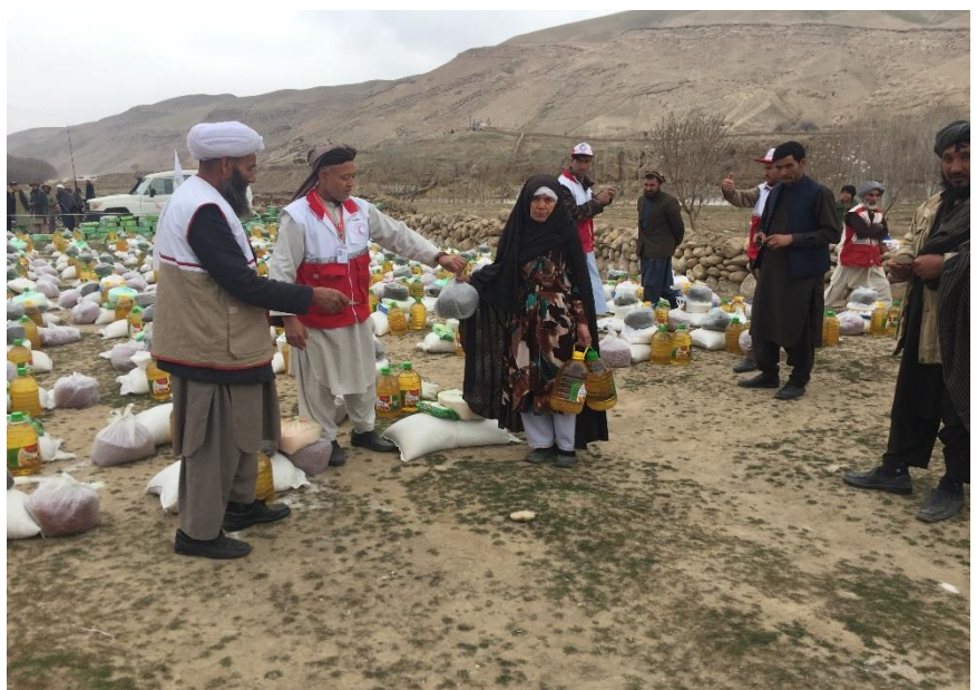
Food distribution in Farah province.

ARCS local branches have completed the assessment for flood and drought affected families. In total 9,000 families will be assisted in the target 13 provinces. So far, 3,000 families have been assisted through food parcels in three provinces. The procurement of food parcels, sourced locally, has been completed by the IFRC CO for additional 6,000 families. The quality assurance of the food quality and lab test has been done following IFRC standard