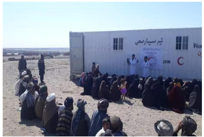
Health education/promotion sessions for affected population in Herat province.