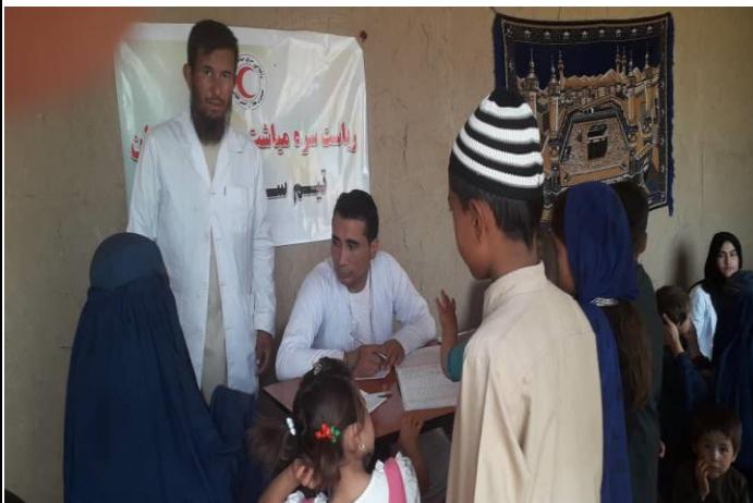
Health services for affected population in Jawzjan province.

Currently there are three MHT running in Herat, Jawzjan and Helmand. Three more HMTs will be deployed in Badghis, Faryab and Kandahar and the recruitment for HMTs personnel is ongoing and will be completed end of October. The IFRC country office has completed the procurement process with technical support of Geneva team for 20 medicines kits for six MHTs support and transported to respective provinces for MHTs. The CBHFA will commence its activities such as refilling 500 First aid kits, CBHFA trainings in 4 provinces (Herat, Kandahar, Faryab and Jawzjan) and printing of 1,000 First Aid guidelines – to be completed in November.