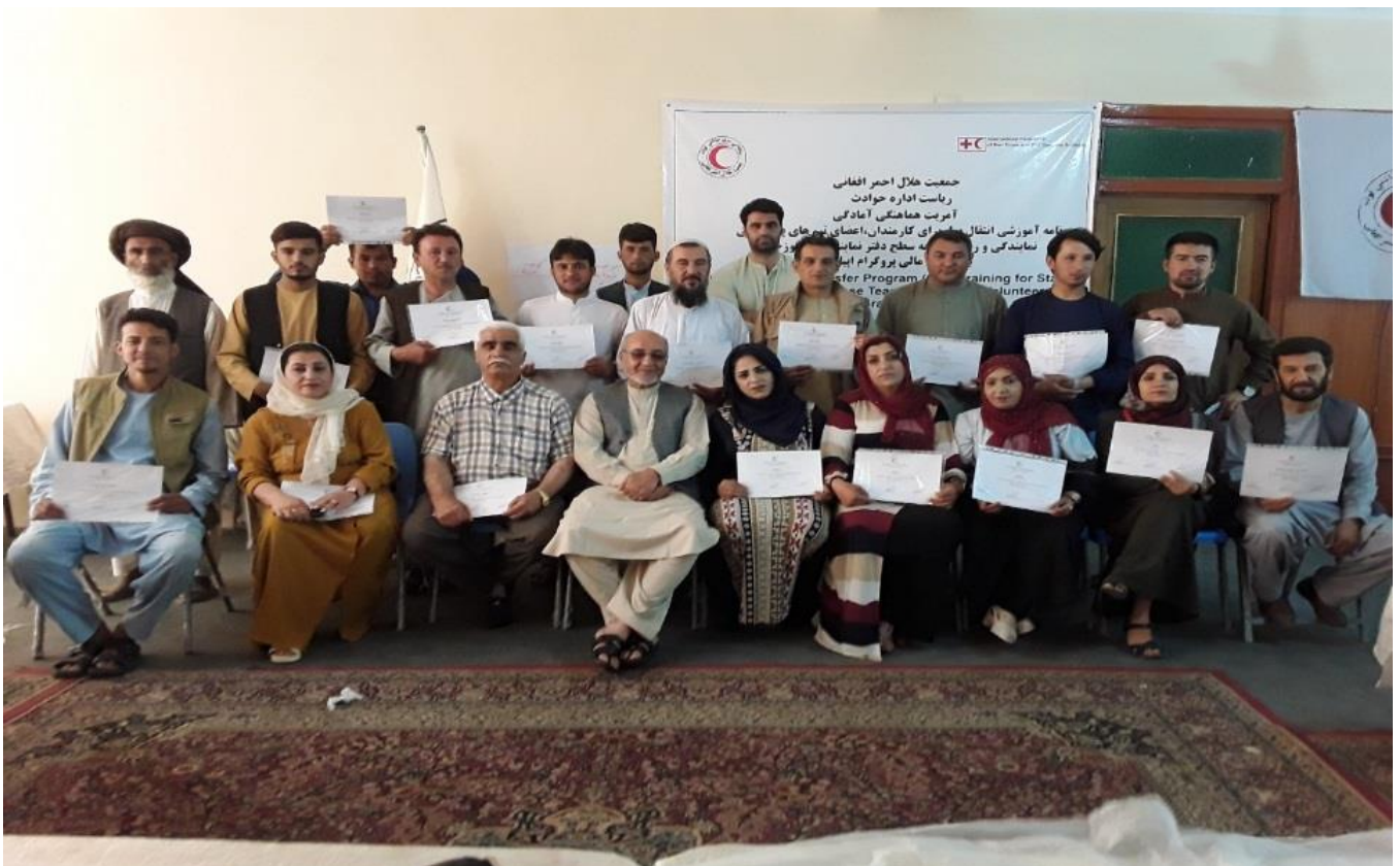
Cash transfer programming training in Jawzjan province.

ARCS has conducted the 4-days Cash Transfer Programme (CTP) training in Jawzjan province with branch staff and volunteers. The aim of this training was to build the capacity of ARCS core staff/volunteers in term of Cash Transfer Programming in Emergencies, in order to effectively respond to any emergency by using cash as a response mechanism.