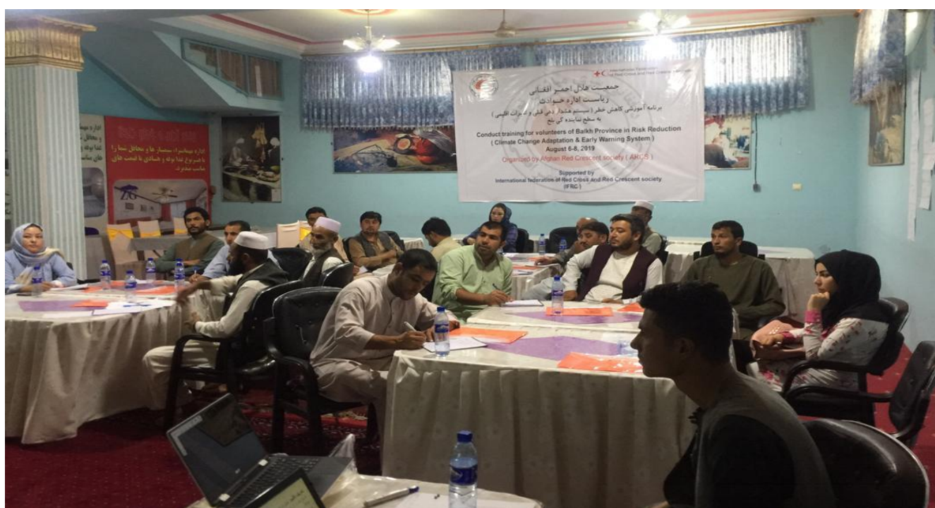
ARCS staff and volunteers training on disaster risk reduction & climate change adaptation in Balkh province.

The training course included several group discussions and experience sharing, as well as practical sessions. During the practical sessions, participants learned basic disaster management terminologies, mapping of natural disaster risks and their history in the area, community emergency evacuation and contingency planning at local level.