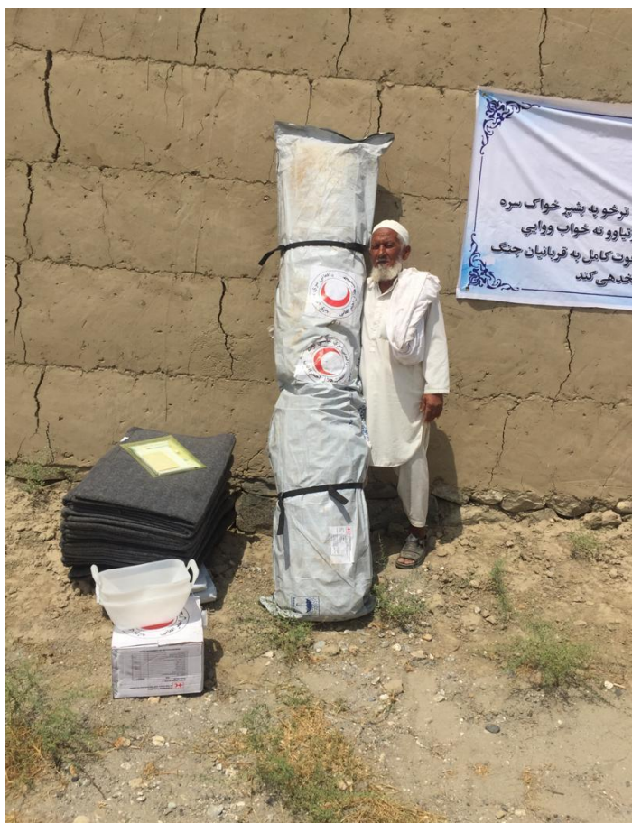
Emergency shelter & non-food household items distribution in Nangarhar province.

ARCS national headquarter teams have trained branch level staff and volunteer (male: 72 & female: 28) on safer shelter techniques to further staff and volunteers are conducting sessions for local communities. ARCS staff oriented the affected families those who received shelter assistance on installation of emergency shelter in the safe areas.