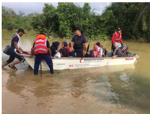
MRCS Kelantan Branch volunteers supporting local agencies evacuating affected people trapped in the flood in Kelantan.

Significant heavy rains from 26 November 2019 have caused flooding in four states in Peninsular Malaysia, namely, Johor, Kelantan and Terengganu. The floods have temporarily displaced about 15,000 people primarily in Kelantan and Terengganu. The situation following the weekend (30 November 2019) saw water level increasing in several affected districts in this both states. In Kelantan, the Kelantan river, Golok river and the Galas river rose above 10 meters, exceeding its the danger levels of nine meters. The peak river stage of 11 meter was the highest in the last four years which was averaging around eight to nine meters which cause the worst flooding in the Northern Malaysia since 2014 deluge. 2 The 2014-2015 floods was the worst in the history with water level hitting the mark 25m at the rivers. In the subsequent years to 2015, the river levels were constant at 8 metres and this year it peaked at 11 metres.