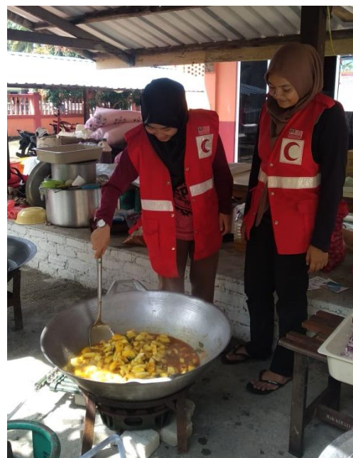
MRCS Kelantan branch volunteers cooking food for affected people in the evacuation centre.

Furthermore, the MRCS Terengganu branch has organized a relief programme in Kuala Nerus on 4 December 2019 at 5.00pm (local time) where 80 families were provided with children's clothes, buckets and disposable diapers to 80 families.