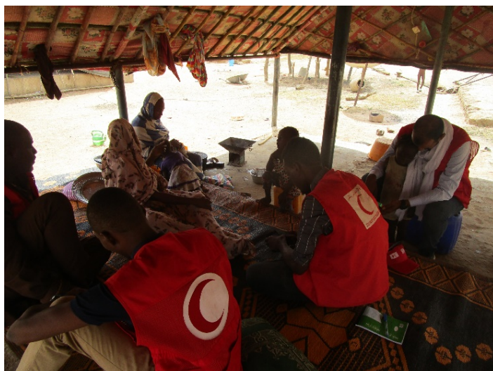
MRC volunteers conducting needs assessment in Selibaby

From 24 to 26 August 2019, Guidimakha Wilaya (Region), located in southeast Mauritania, witnessed torrential rains. This region was already facing an unusual delay in the raining period which caused the drying of the herbaceous mat and destroyed the first seedlings. A total of 7 deaths were reported in three areas namely Selibaby, Khabou and Ould Yengé. Hundreds of households were homeless. Several fields were destroyed, and livestock decimated. It is worth precisizing that the rains exceeded 200 mm in the regional capital city of Sélibaby and 300mm in several other areas. The rains constituted the average equivalent of 6 months of precipitation in the region. The torrential rains caused heavy material damages in the households, roadside markets, water supply infrastructures and general infrastructures Household food stocks were also washed away, etc.