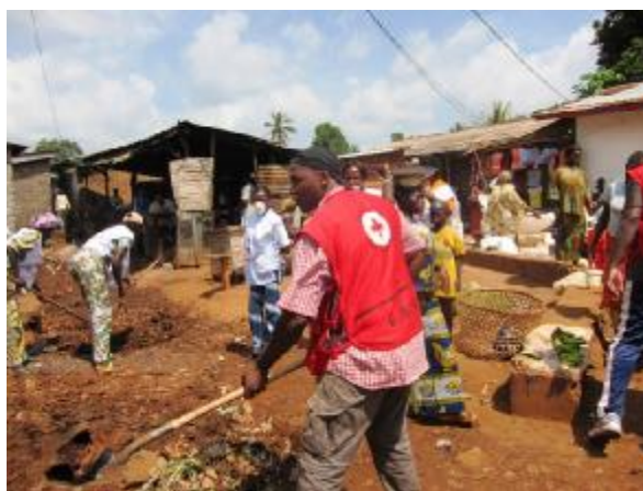
CAR Red Cross volunteers organized general sanitation campaign with the participation of communities to help prevent the spread of cholera.

For reasons internal to CAR Red Cross, the operation timeframe was extended from January to February 2012 as highlighted in DREF operation update number one. The remaining activity was the training of an additional 50 Red Cross volunteers on the epidemic control manual for volunteers (ECMV) in Mongoumba, a neighbouring locality with DRC that was also seriously hit by cholera epidemic at the same time. Although this activity was not planned in the DREF operation, the national society deemed it necessary and urgent considering that many cases registered in Mongoumba and the surrounding localities were coming from neighbouring DRC. Thus, the Red Cross needed increased preparedness to face the situation. The 50 volunteers were trained in Mongoumba during the extension period using the community-based health and first-aid approach (CBHFA). Community-based sanitation activities and role-plays on the