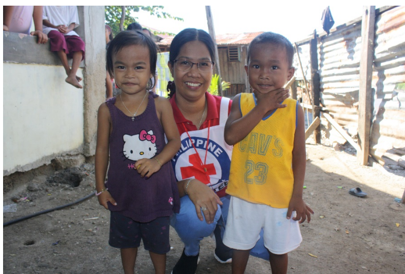
To support the government's effort in reaching many children to be vaccinated, PRC, through its chapters, has been mobilizing trained volunteers to vaccinate children.

Between 1 July and 3 December 2019, six human cases and 13 environmental samples were confirmed with cVDPV2, all genetically related. All human cases were reported from BARM 1 , while environmental samples were found in Davao Region and National Capital Region (NCR). The environmental samples of 13 cVDPV1 found in Manila are genetically linked, while the first human case confirmed with VDPV1 from the island province of Basilan in BARM was found not to be closely related to