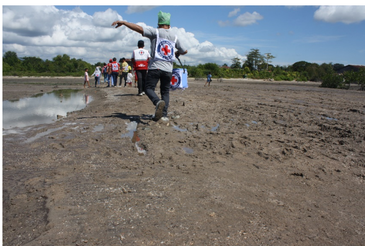
Chapter staff and trained volunteers are crossing muddy paddy to reach the coastal communities to administer polio vaccine to children.

All volunteers recruited and mobilized received orientation on the history and seven fundamental principles of the Red Cross Red Crescent Movement. All volunteers mobilized for this operation are insured under the Membership and Accident Assistance Benefit (MAAB) of PRC.