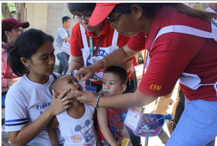
In Zamboanga City chapter, parents/guardians who were gathered in a waiting shed were encouraged by PRC to let their children be vaccinated.

The PRC, in close coordination and collaboration with the DOH), health partners (WHO and UNICEF) and the rural health units, (RHU) conducted the first and second rounds of synchronized polio vaccination in nine cities of the National Capital Region (NCR) and 12 provinces in Mindanao from 14 – 27 October 2019, and from 25 November – 7 December. The PRC reached 155,424 children vaccinated against the goal of 100,000 children, mobilizing a total of 900 volunteers per day.