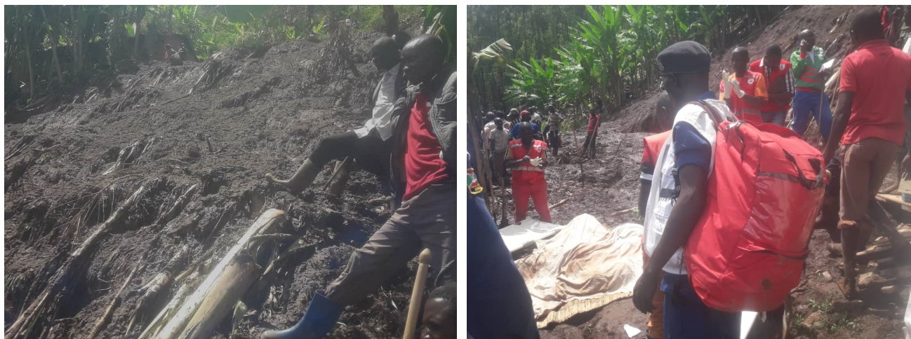
Photo 1: Left side: Landslides as effect of floods in Mugina Commune

livelihood, livestock and infrastructure. A new flood event happened on December 22 nd affecting 787 people in the northern neighborhoods in Bujumbura 7 .