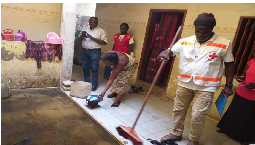
A Red Cross volunteer providing assistance to a floods affected household

The SRCS has been involved in relief activities from the beginning of the floods. So far, response activities have been conducted at local branch level with support from local authorities. Following accumulation of heavy rains on September 16 2019, a total of 50 SRCS' volunteers from branches and emergency response teams (including 4 national staff members and 4 NDRT specialized in Wash, Health, Shelter and CVA) were deployed to Dakar and Kaolack regions to provide assistance to the affected communities. In collaboration with territorial authorities, they supported the relocation of 408 people in schools identified as evacuation shelters. The field teams conducted a rapid assessment of the situation and provided psychosocial first aid support to a dozen of households. In a similar way, several types of support such as hygiene promotion sessions, surveys and census, support for displacement and relocation in schools, and distributions of MILDA (long lasting mosquito impregnated nets) have been provided to 4 500 displaced people (500 households) who have been living in school premises and unfinished houses.