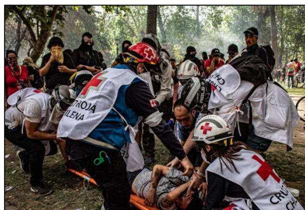
The Chilean Red Cross (ChRC) provides first aid in Santiago and other locations.

Chile currently faces situations of civil unrest in the regions of Valparaíso, Biobío, Antofagasta, Araucanía and the Metropolitan Region of Santiago de Chile. Of the 254 demonstrations in 16 regions, 3,583 people have been wounded nationwide, of which 2,050 were wounded by gunfire (steel, lead and rubber bullets, balls and pellets), and 359 suffered eye injuries 1 (trauma and bursting or loss of eyeball), 26 people are dead 2 and 9,589 have been detained. The Chamber of Commerce estimated losses of over 1.4 billion US dollars due to destruction, looting and decreased sales 3 . Of the estimated losses, 900 million US dollars is due looting and destruction of stores with an