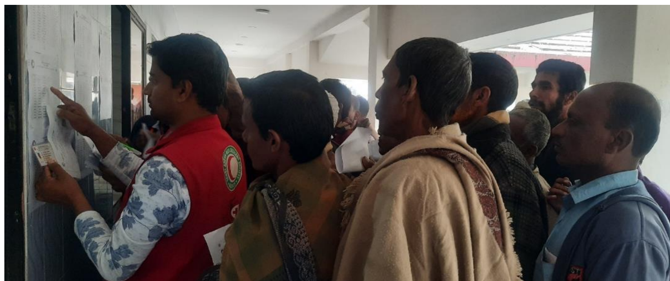
BDRCS volunteers are helping affected people to find out their name in the final list in Pirojpur district.

In addition to that BDRCS has planned to organize orientation session on minimum standards for PGI and CEA in emergency for the NDRT teams and staffs on 1 January 2020 at NHQ. In this session, reference handouts will be disseminated among the participants. These trained participants will also conduct similar orientation in their assigned districts.