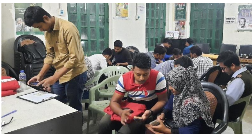
BDRCS Satkhira RC unit's volunteers are getting orientation on ODK, CEA and PGI.

In this operation, under the leadership of BDRCS response department all the concern departments are actively working since the beginning of the operation. In addition to the seven BDRCS district unit offices are actively working in close coordination with BDRCS NHQ. More than 900 volunteers and staff were mobilized and actively worked prior to the cyclone Bulbul land fall to disseminate and to evacuate most vulnerable people in the coastal districts. During the initial relief distribution more than