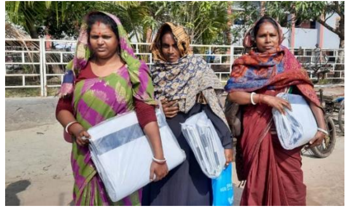
Cyclone Bulbul affected people received tarpaulins and technical guidelines on fixing from BDRCS.