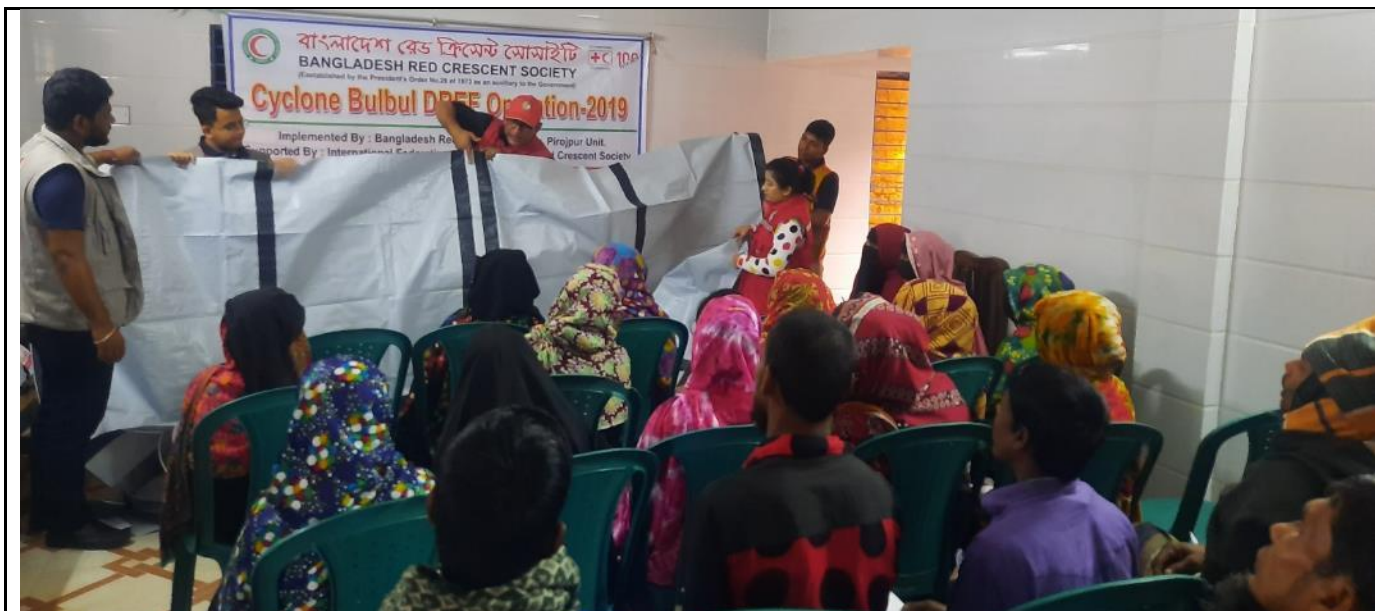
Demonstration session on proper fixing of tarpaulin by the BDRCS prior to the distribution among the cyclone affected people in Pirojpur district.

BDRCS faced difficulties to mobilize these emergency shelter items from Chattagram warehouse to the affected districts due to transport strike that continue for one week in mid-November. However, once the strike was over, immediately BDRCS dispatched relief items form warehouse to affected districts.