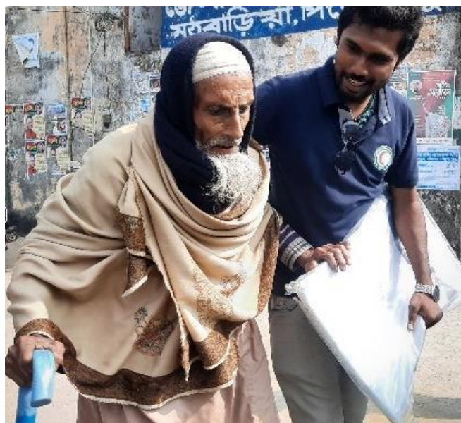
BDRCS volunteer is helping people for carrying the tarpaulin in Pirojpur district.

BDRCS has been active since the beginning of cyclone formed and regularly participating in government's decision-making meetings in order to collaborate accordingly. BDRCS along with IFRC Country Office (CO) and other Movement partners closely monitored the situation, had regular coordination meetings during its progression. Around 900 Red Crescent Youth (RCY) volunteers were engaged with CPP volunteers in disseminating early warning messages, evacuation of the people to the cyclone shelters, distributing dry food and drinking water as well as providing First Aid services to people taking shelter. Another 22,000 RCY volunteers were kept on stand-by in the coastal districts for immediate deployment. BDRCS closely coordinated with the CPP, and more than 55,000 CPP volunteers were engaged throughout the coastal areas.