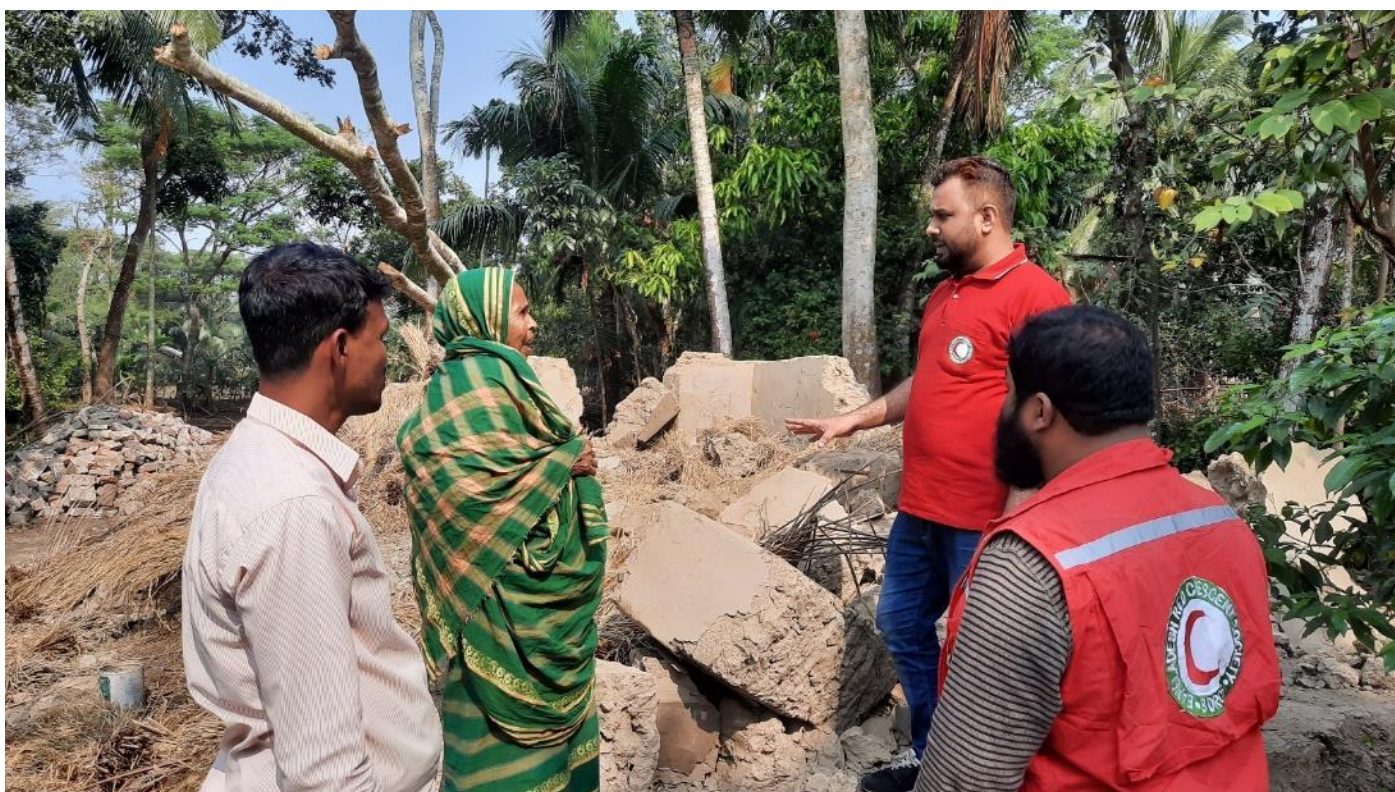
BDRCS conducting assessment in the Cyclone Bulbul affected areas in Satkhira district.

Major livelihoods of the affected area are agriculture and fisheries complemented by livestock. According to the joint rapid assessment, both agriculture and fisheries were significantly affected due to cyclone Bulbul. Winter vegetables are the worst affected, followed by rice ('Ropa Aman' variety). Total loss of winter vegetables is USD 9.3 million (approx. CHF 8.9 million) and Ropa Aman is USD 5.5 million (approx. CHF 5.4 million). Agriculture inputs and food security livelihood assistance are primary needs of the affected community as the cyclone made landfall just before harvesting. The heavy rainfall and tidal surge due to cyclone Bulbul caused massive damage to fisheries and livestock. Most of the ponds and ghers (fish farms) were flooded and fishes were washed away. Total fisheries loss is USD 5.5 million (approx. CHF 5.4 million). Total 11,223 hectares of pond/gher land was affected. The initial livestock damage is reported as USD 285,000 (approx. CHF 281,979).