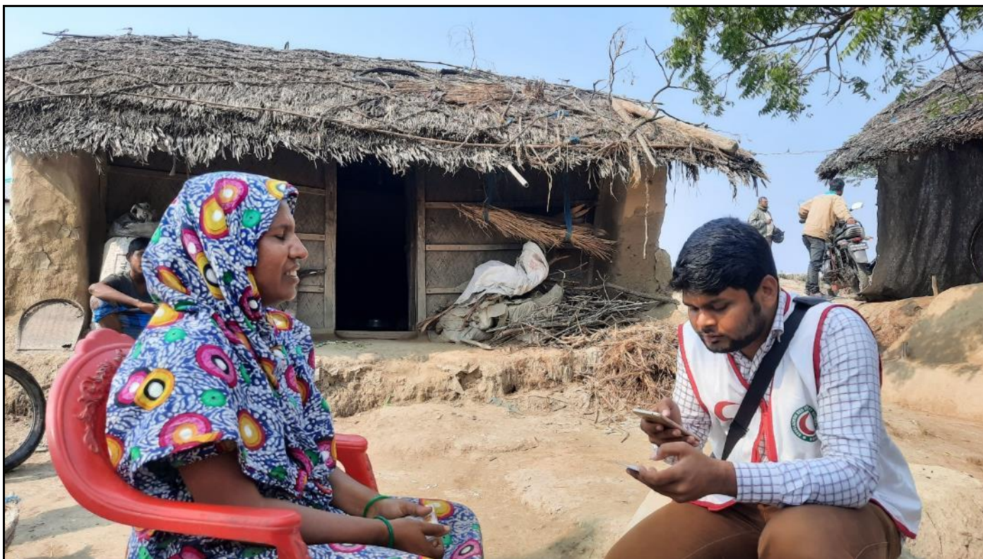
BDRCS volunteer carrying out the need assessment through ODK in the cyclone affected district.