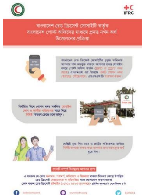
Leaflet developed in Bangla for the MPCG process through the post office.

BDRCS with the support of IFRC CO has developed a leaflet in Bangla language describing the steps of MPCG process through post office. These leaflets will be disseminated among the final targeted families with proper orientation. This will help the overall distribution process.