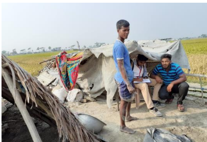
BDRCS carrying out need assessment in Cyclone Bulbul affected Khulna district.

The special weather bulletin issued by the Bangladesh Meteorological Department (BMD) informed about a cyclone developing over the northwest Bay of Bengal (BoB) on the 7 November 2019. Cyclone "Bulbul" reincarnating from Cyclone "Mamto" categorized as "very severe", made landfall over India on 9 November 2019 before entering Bangladesh on 10 November 2019 (Bangladesh local time 12:00 am -1:00 am). The cyclone impacted total thirteen southern districts of the country while packing up winds of up to 120 km/h (75 mph) and gusts of up to 130km/h (80mph). The cyclone stayed in Bangladesh for around 36 hours-one of the longest enduring cyclones that Bangladesh has ever faced in the last 52 years. The impacted coastal sea line faced greater than three meters inundation at average due to the heavy precipitation and tidal surge 1 . According to Khulna Met Office 2 , the cyclone hit the Sundarbans with a wind speed of 120-130 km/h.