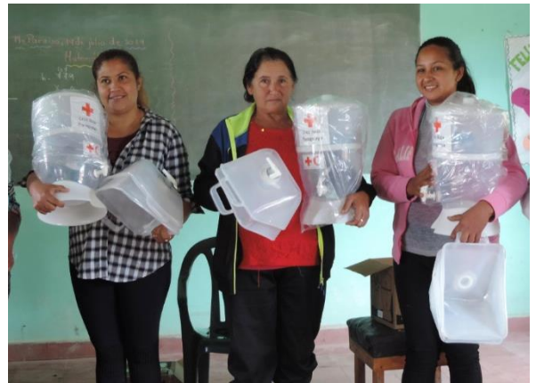
The Paraguayan Red Cross distributed and trained in the use water filters.

The main problems identified by the floods were linked to geographical conditions and population: extensive territory, impassable and inaccessible roads, isolated communities, vulnerable population, effects on their livelihoods, and food security.