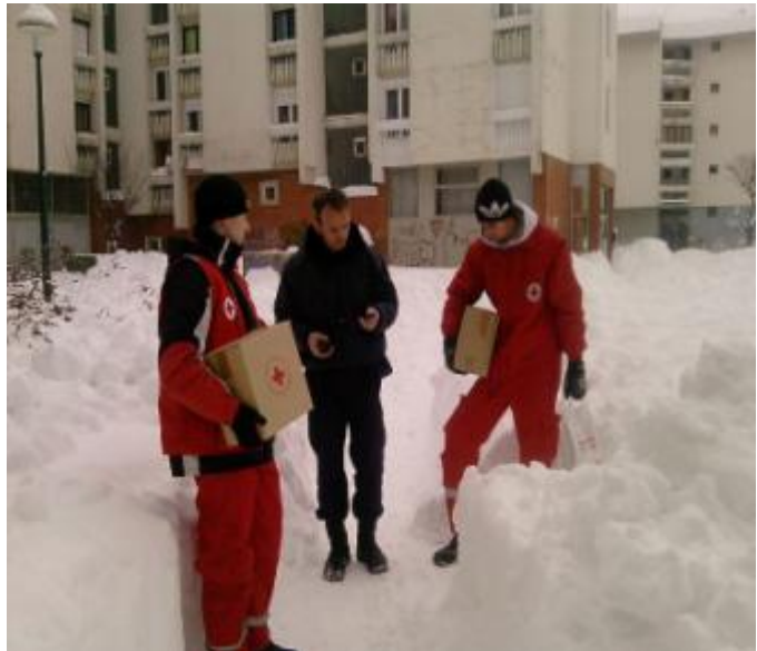
In February 2012, volunteers rushed to distribute food parcels and blankets.

The Canadian Red Cross and the Canadian International Development Agency (CIDA) contributed with CHF 23,069, and the Netherlands Red Cross and the Netherlands Government contributed with CHF 24,184 to the Disaster Relief Emergency Fund in replenishment of the allocation made for this operation. Due to the subsequent VAT reimbursement after the operation, there is a final balance of CHF 31,398 which will be returned to the DREF funds.