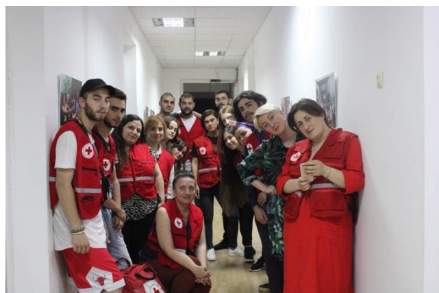
Image 2: GRCS Disaster Response Team mobilized in the HQ office.

The Georgia Red Cross Society has formed three mobile units composed of volunteers (consisting with DM, FA and PSS volunteers) and HQ staff who in case of need will provide first aid and psychosocial first aid to the people attending or participating in the demonstrations. The mobile units are distributing drinking water donated by the Georgia Red Cross Society's corporate partners. 12,500 bottles of water have been mobilized by the National Society Fund Raising team from EDS "Borjomi", "Bon Aqua", "SNO" for supporting people in need during the protest.