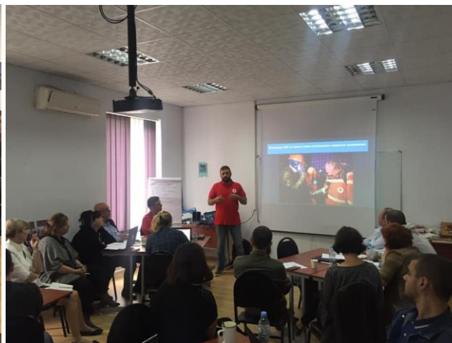
Image 8 & 9: Ukrainian Red Cross is conducting the training – practices from the demonstrations