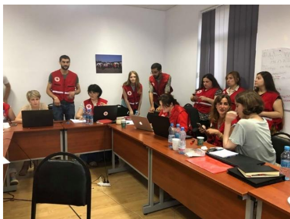
Image 5: GRCS Disaster Response Team mobilized in the HQ office.

Through implementation of the Safer Access Framework, public communications, and direct engagement with people affected by the unrest, it is ensured that staff, volunteers and the wider public are familiar with the role and mandate of the Red Cross, the rationale for why they are assisting people, and how this fits with the Red Cross commitment to neutral, impartial humanitarian action. A brief Q&A document should be prepared outlining these points for staff and volunteers to understand and share. Key messages on neutrality and impartiality was also be prepared for inclusion in public communications materials and activities.