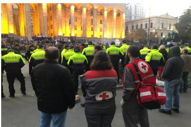
Image 7 & 8: GRCS volunteers on the scene of a demonstration.