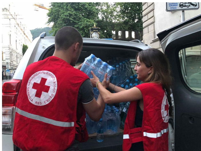
Image 3: GRCS Team ready to distribute water to the demonstration participants.

GRCS First Aid (FA) volunteers were on standby and also they received the trainings and support from the Ukrainian Red Cross (under the RDRT scheme) who have experience in situations of unrest. PSS volunteers were also mobilized and were on stand-by.