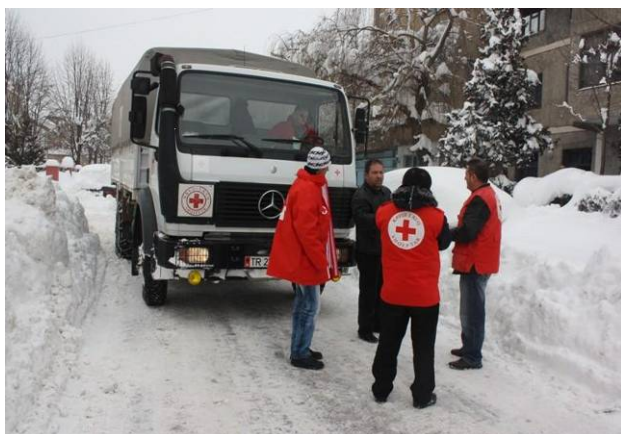
Red Cross Team delivering the relief assistance in Kukes Town

The International Federation of Red Cross and Red Crescent (IFRC) Disaster Relief Emergency Fund (DREF) is a source of unearmarked money created by the Federation in 1985 to ensure that immediate financial support is available for Red Cross Red Crescent response to emergencies. The DREF is a vital part of the International Federation's disaster response system and increases the ability of National Societies to respond to disasters.