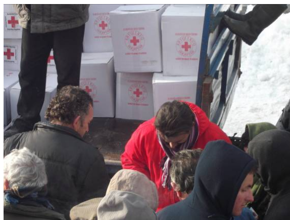
Distribution in Shllak Commune in Shkodra Prefecture

CHF 129,185 was allocated from the IFRC's Disaster Relief Emergency Fund (DREF) on 9 th February 2012 to support the Red Cross of Albania in delivering immediate assistance to some 1,000 families (5,000 beneficiaries) and to replenish disaster preparedness stocks.