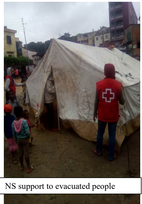
NS support to evacuated people